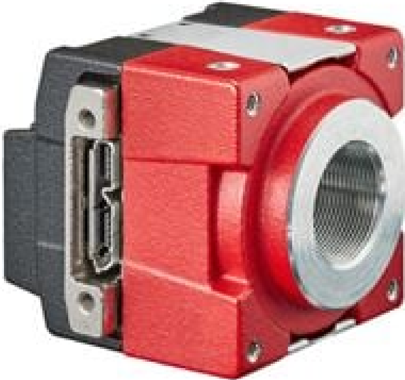
Allied Vision Alvium Camera, Full Housing, S-Mount, Right Angle IO Port (Front)