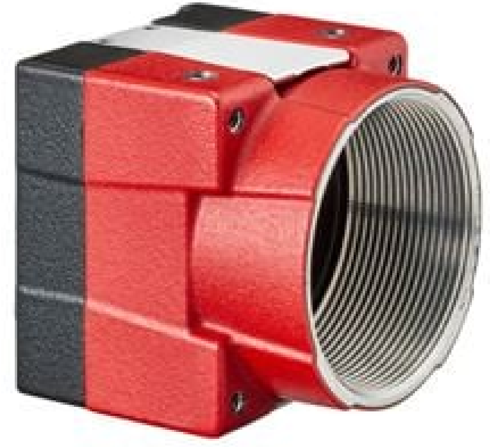
Allied Vision Alvium Camera, Full Housing (Front)