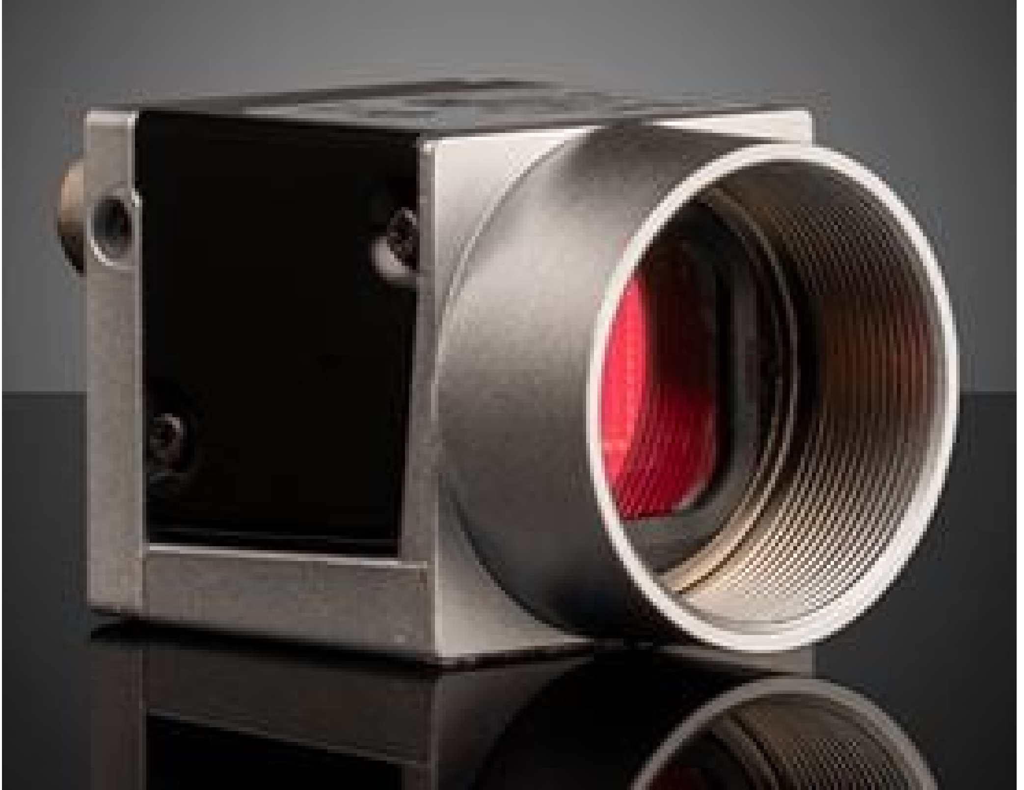
Basler ace USB 3.0 Cameras (Front)