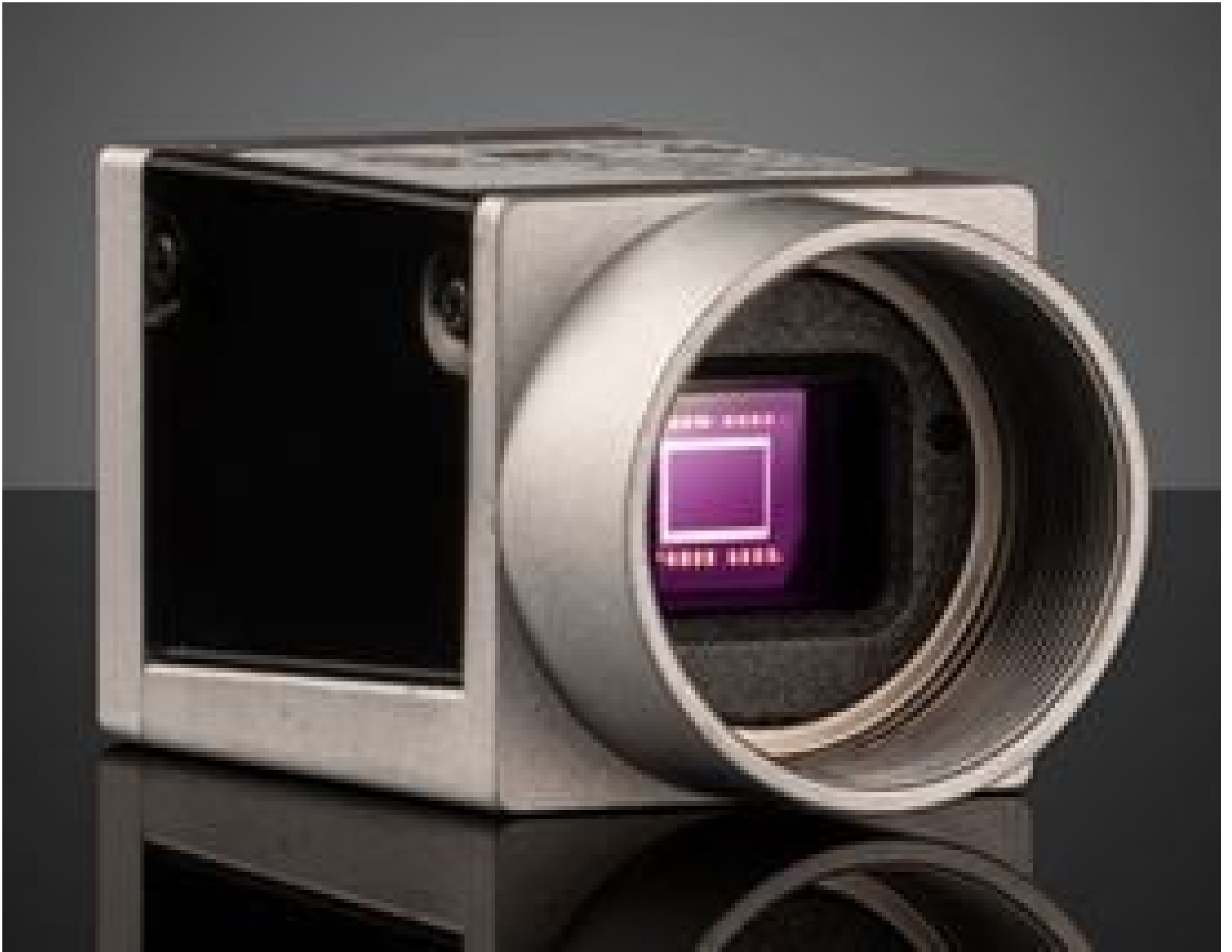
Basler ace GigE Cameras