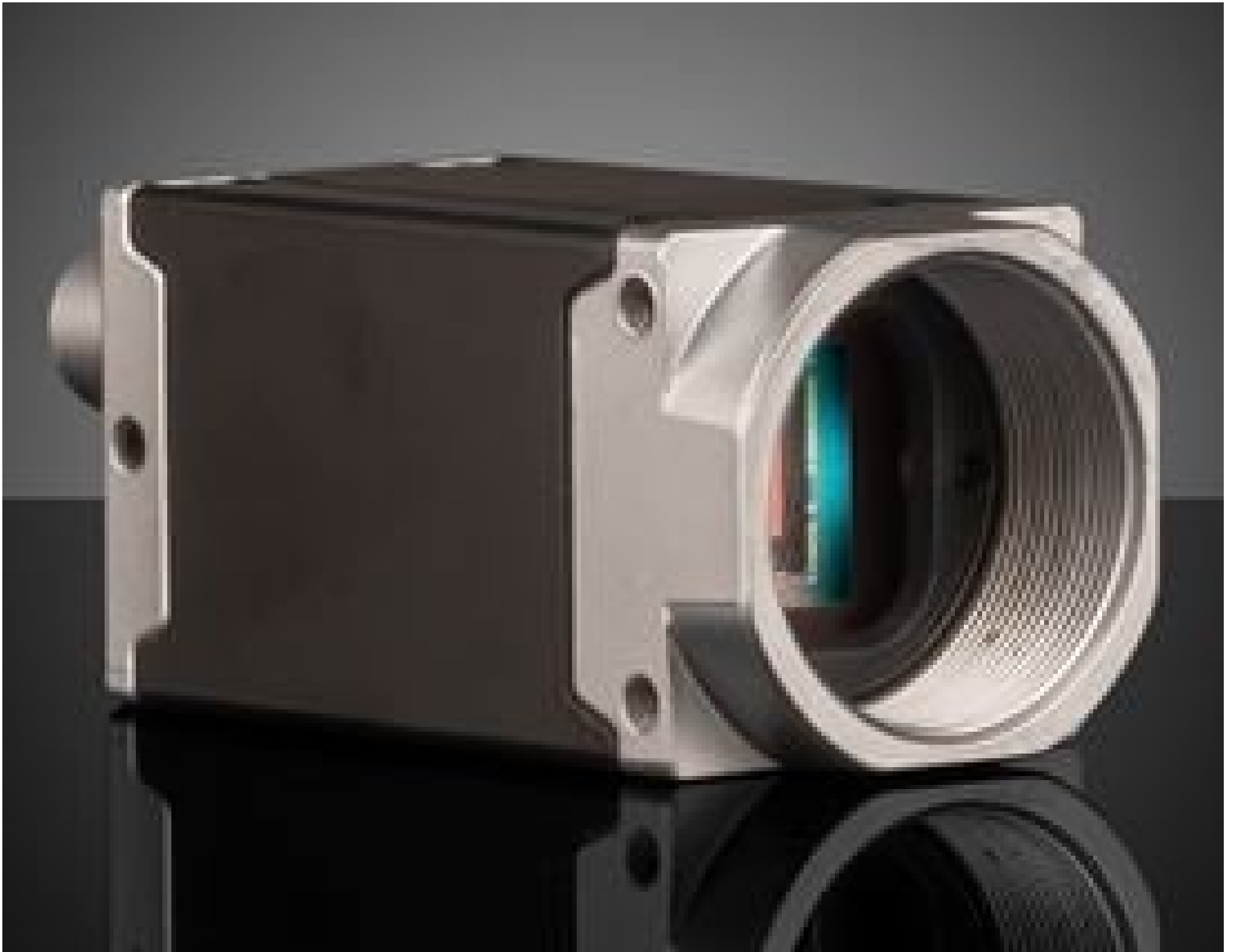
Basler ace2 GigE Cameras (Front)