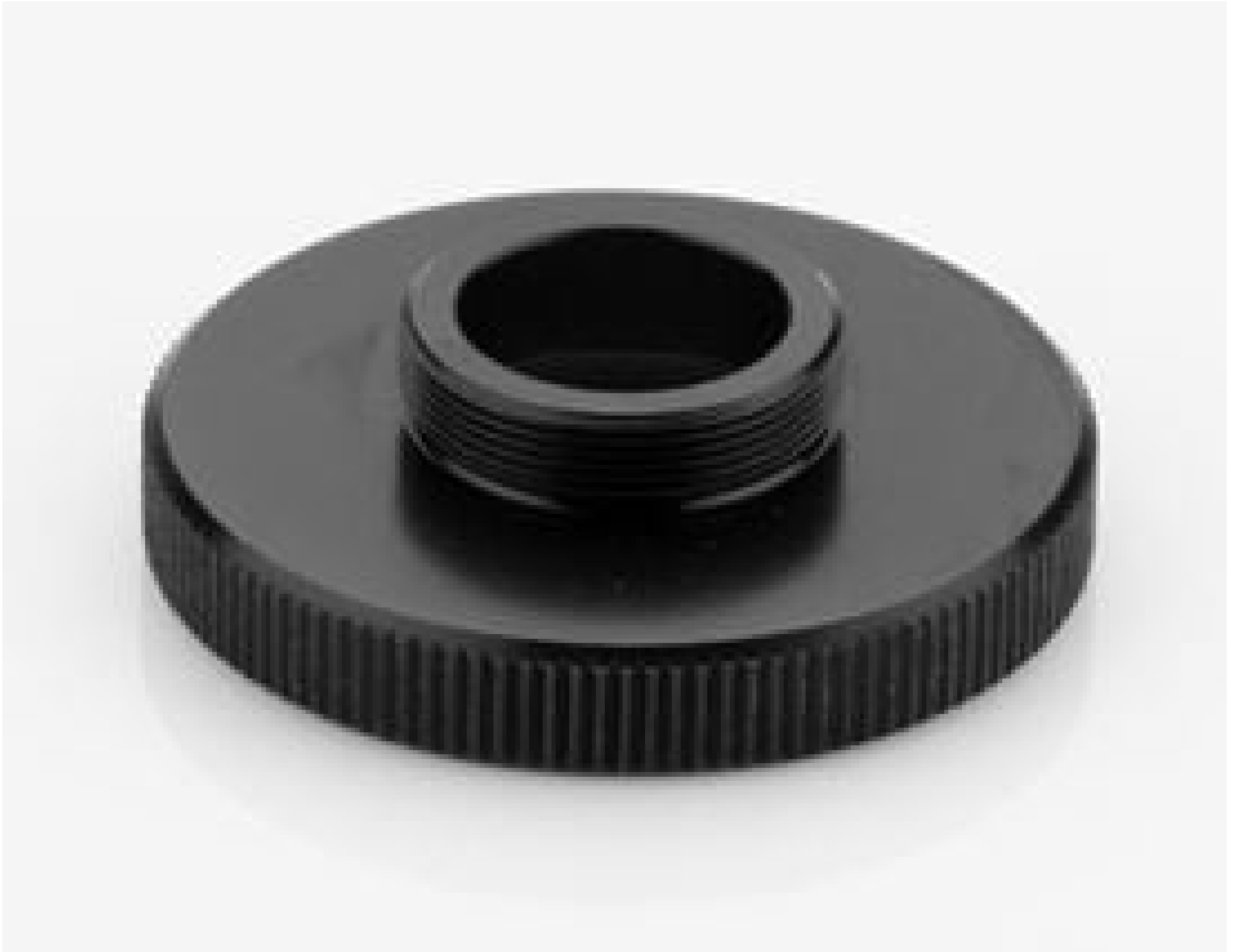
#58-184: C-Mount Adapter for 12 Position Filter Wheel and Assembly