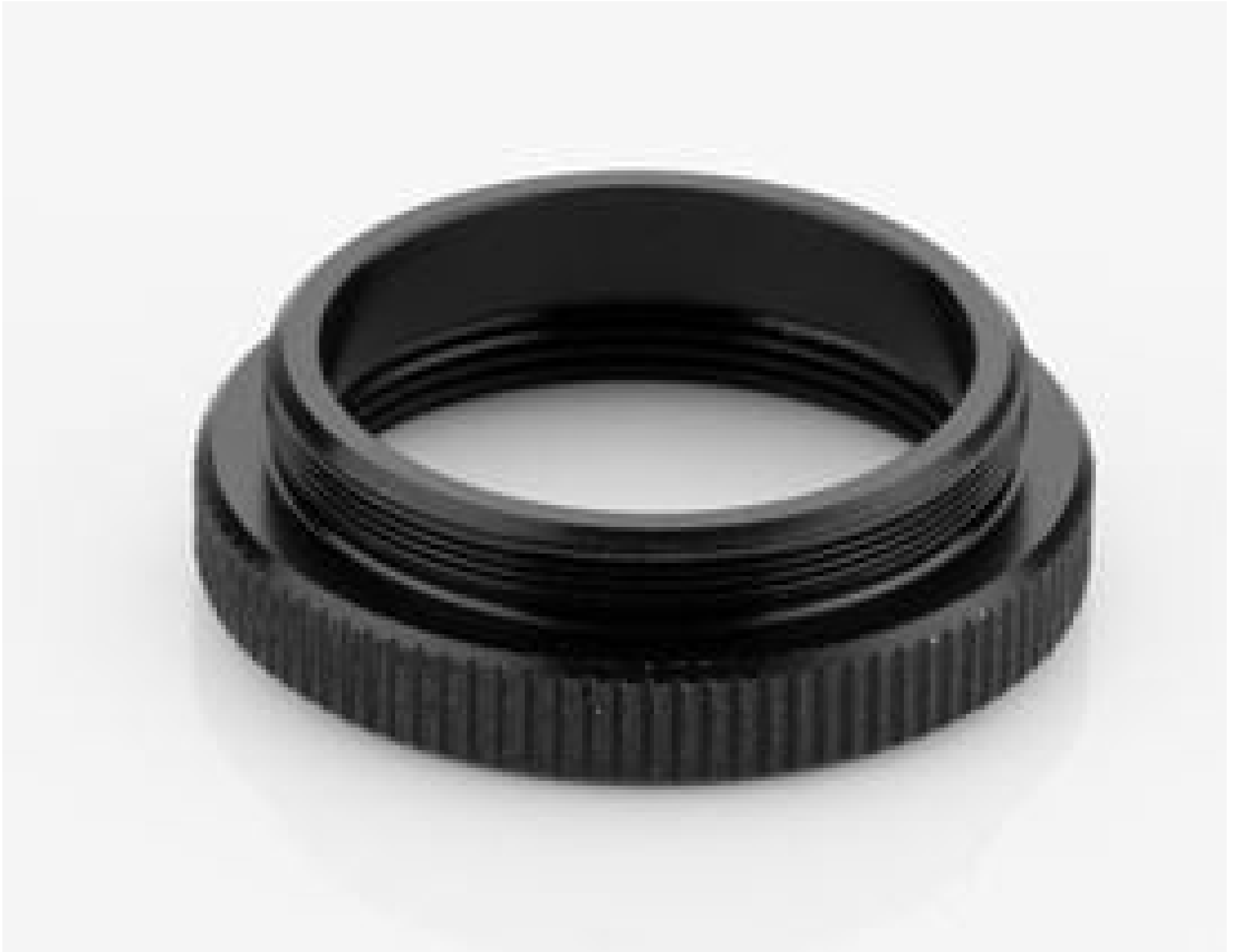
#56-784: C-Mount Adapter for 6 Position Filter Wheel and Assembly