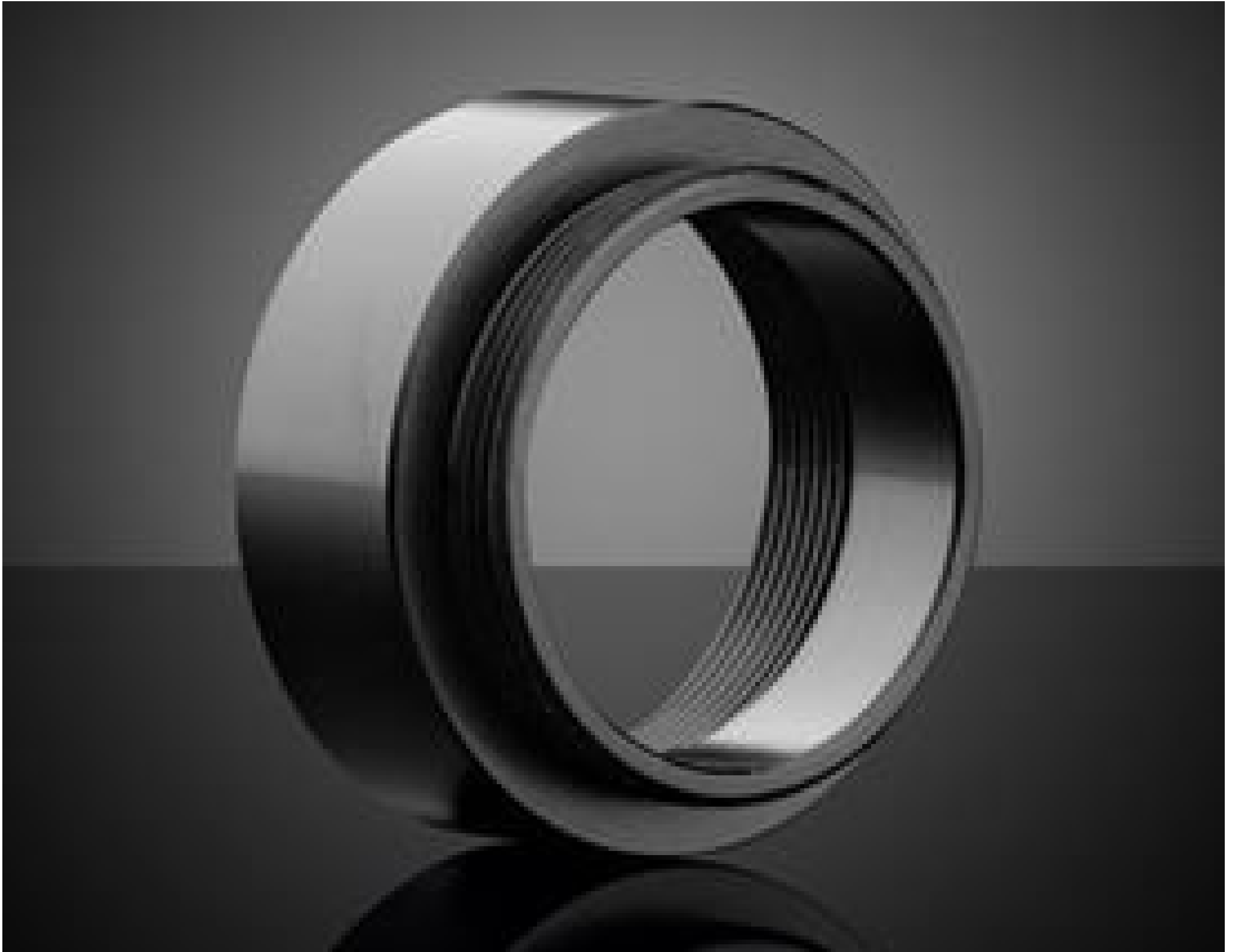
C-Mount to Nikon (M25) Adapter (#11-148)