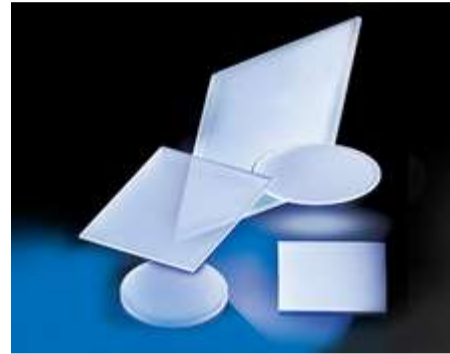
#62-616 - 12.5mm Diameter 220 Grit Ground Glass Diffuser C$19.95