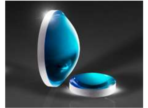
#88-287 - 12mm Dia. x 12.5mm FL, Uncoated Molded Aspheric Condenser Lens C$49.70