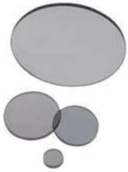
#43-784 - 12.5mm Diameter Unmounted, Linear Glass Polarizing Filter C$66.85