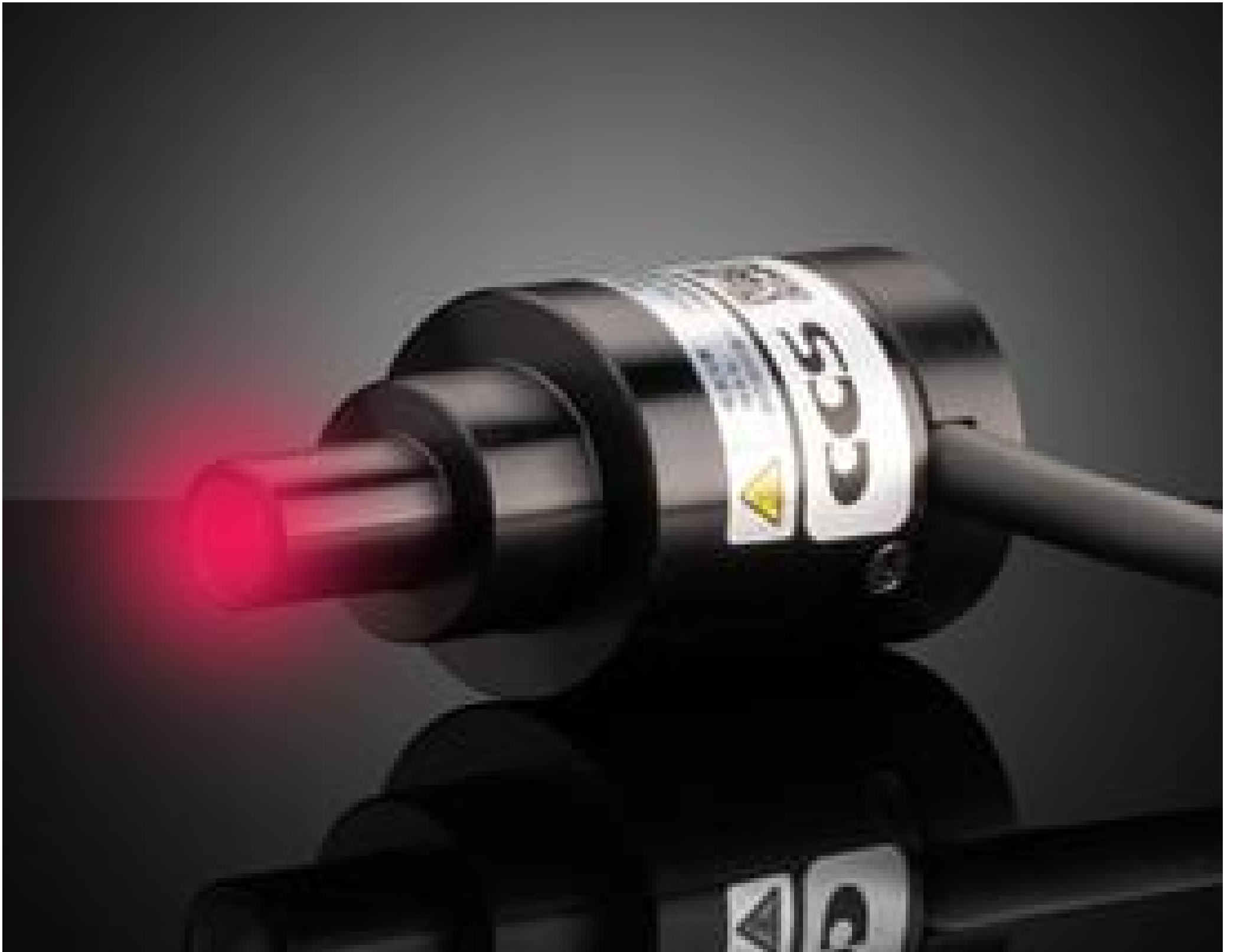
CCS SWIR In-Line Spot Lights