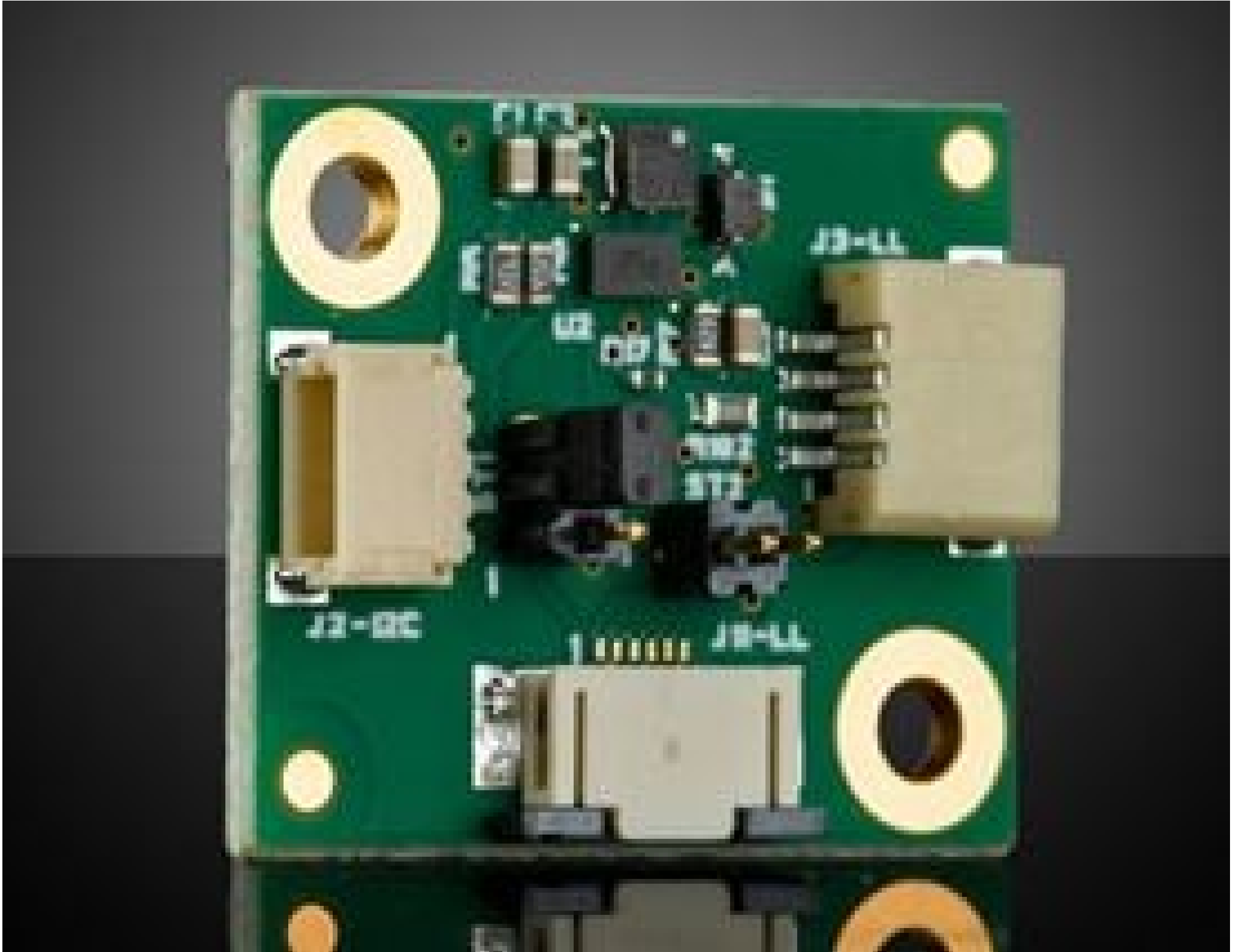
Corning® Varioptic® Variable Focus Liquid Lens Driver Board with Maxim MAX14574 Driver and I2C/DC Input