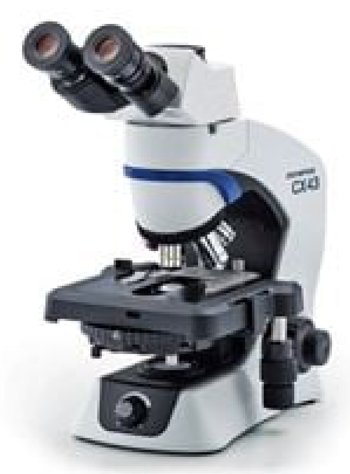
Image shown is full assembly. Each component sold separately. See Technical Information tab for additional details.