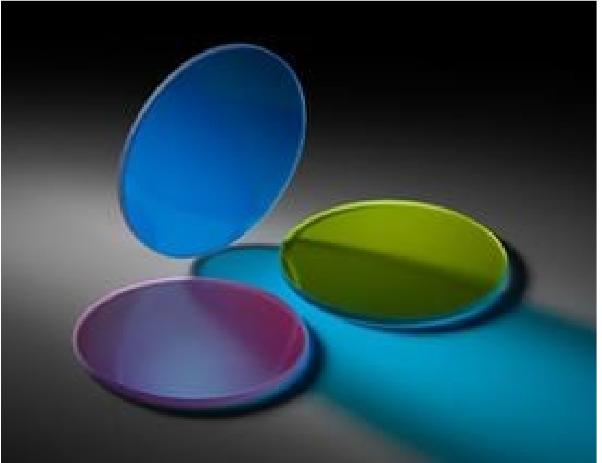
Cyan, Yellow, and Magenta Dichroic Filter Kit