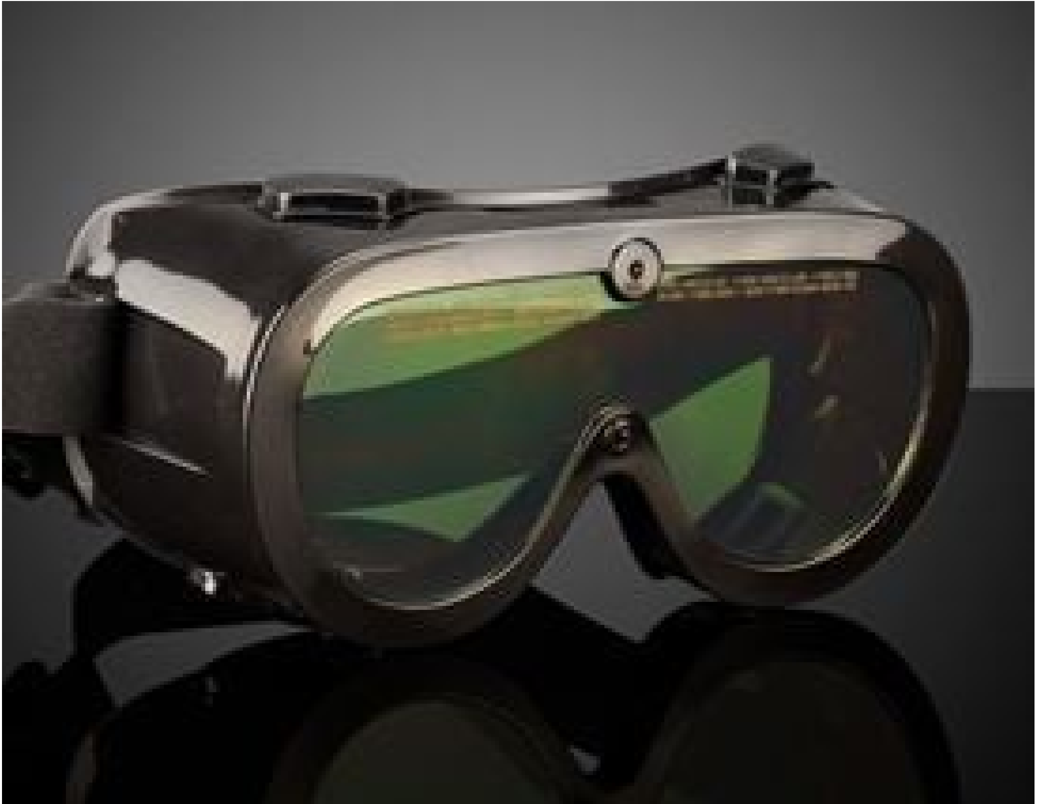
Image represents frame style only. Filter color will vary by product specification.