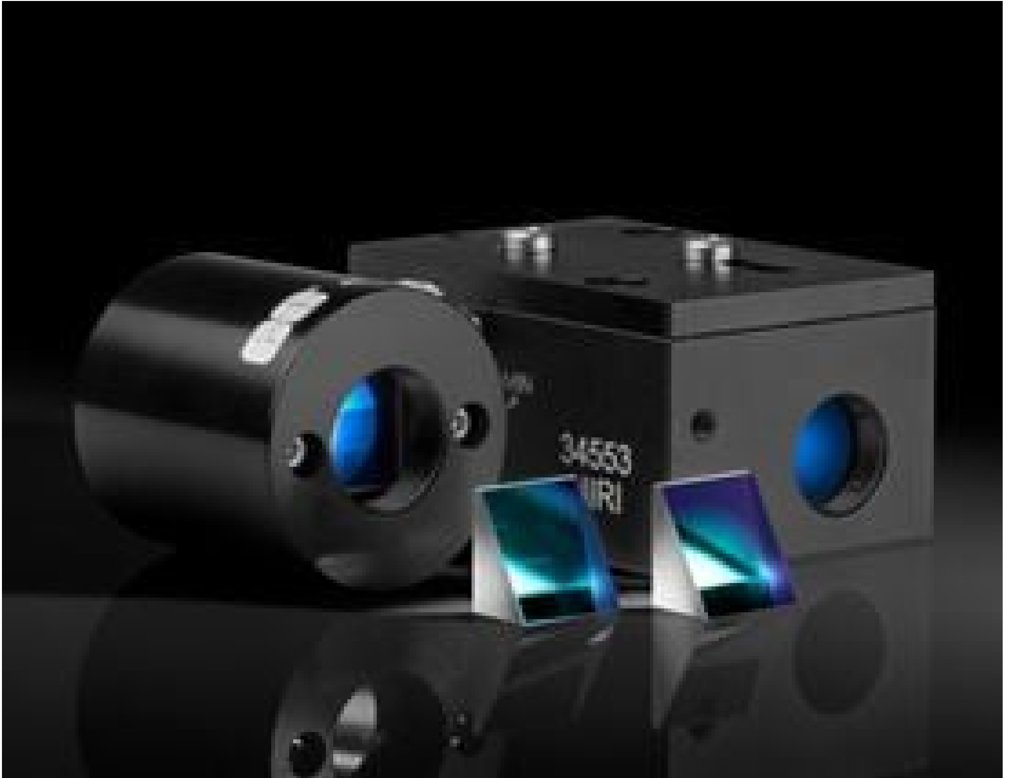
TECHSPEC Mounted and Unmounted Anamorphic Prism Pairs