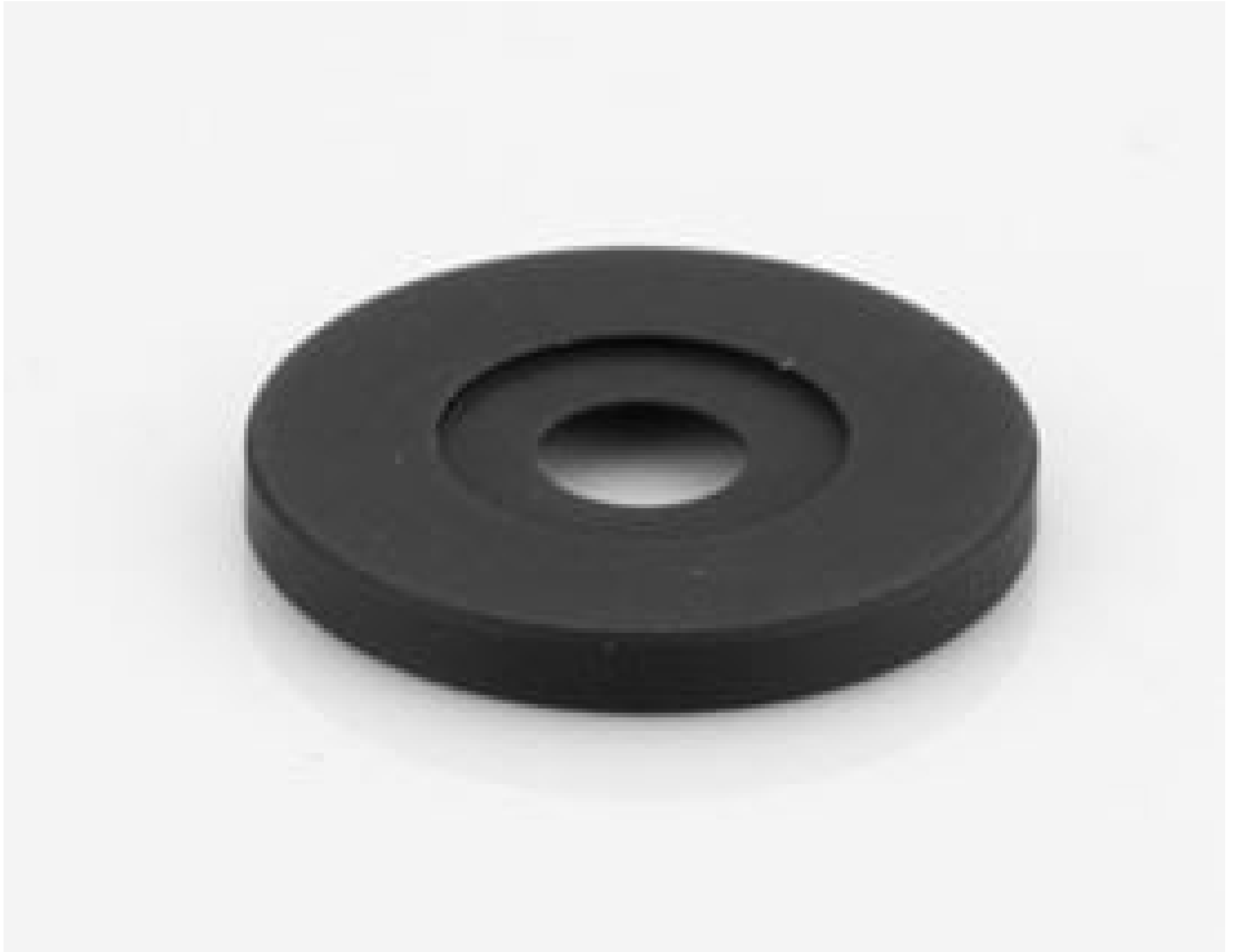
Aperture for Cx Lens (representative photo). Aperture varies by stock number. View PDF drawing for additional information.