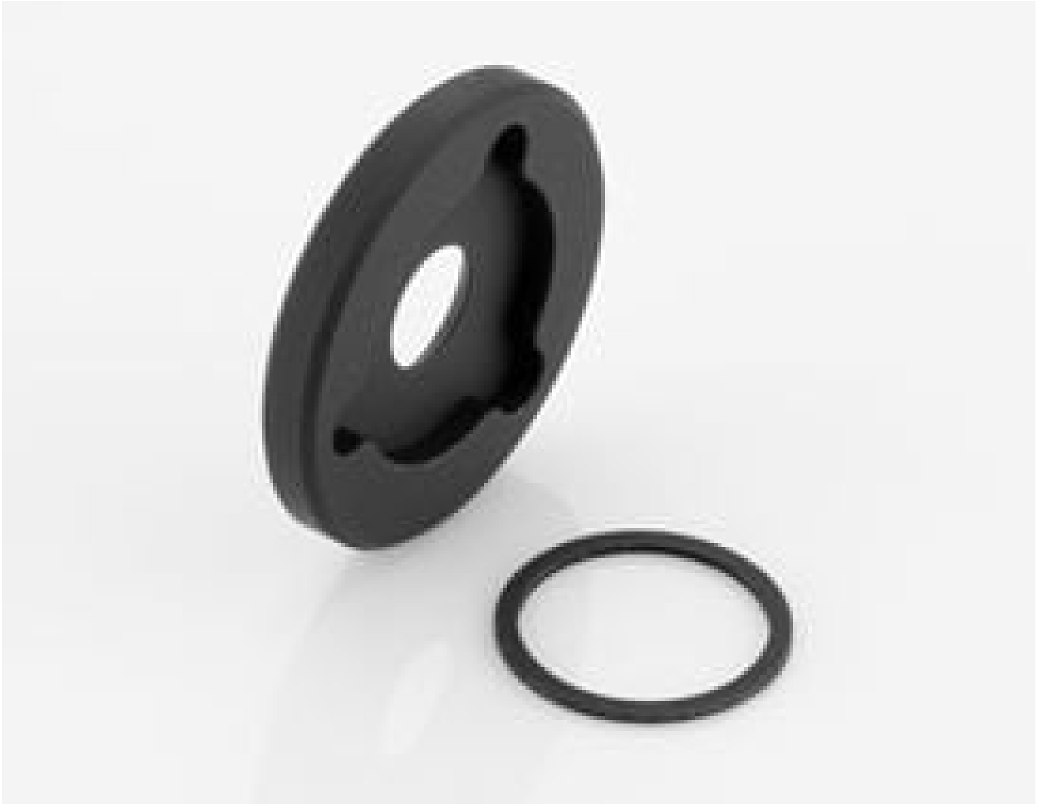
Filter Holder for Cx lens