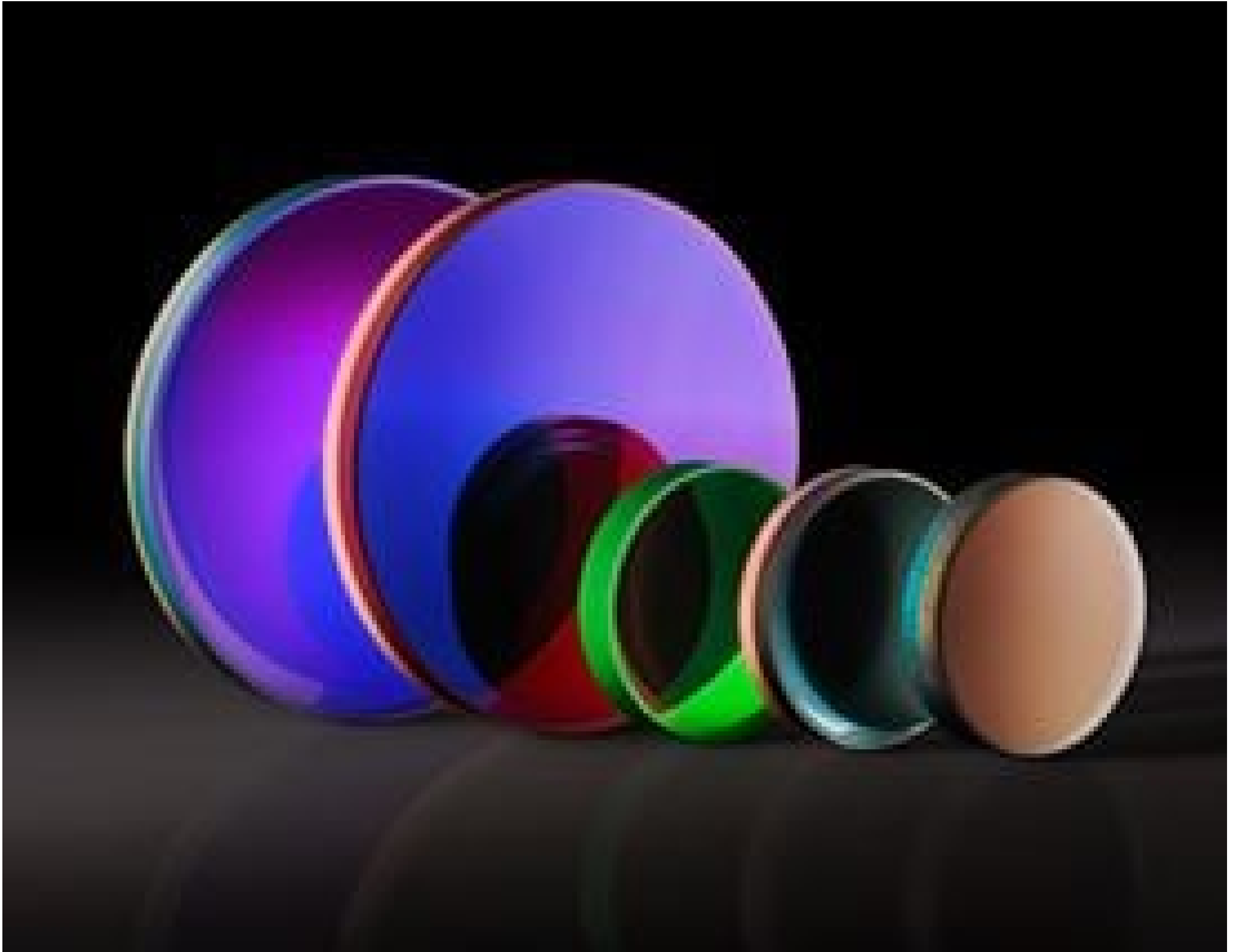
Astronomy Bandpass Filters