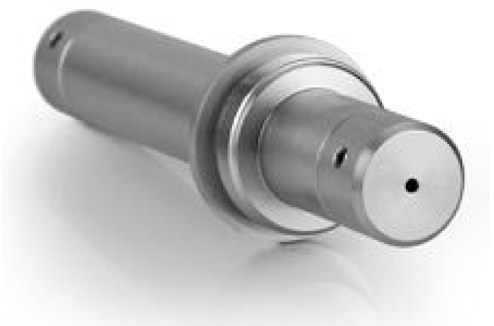
Flat Top Beam Shaper Aligner, #34-313