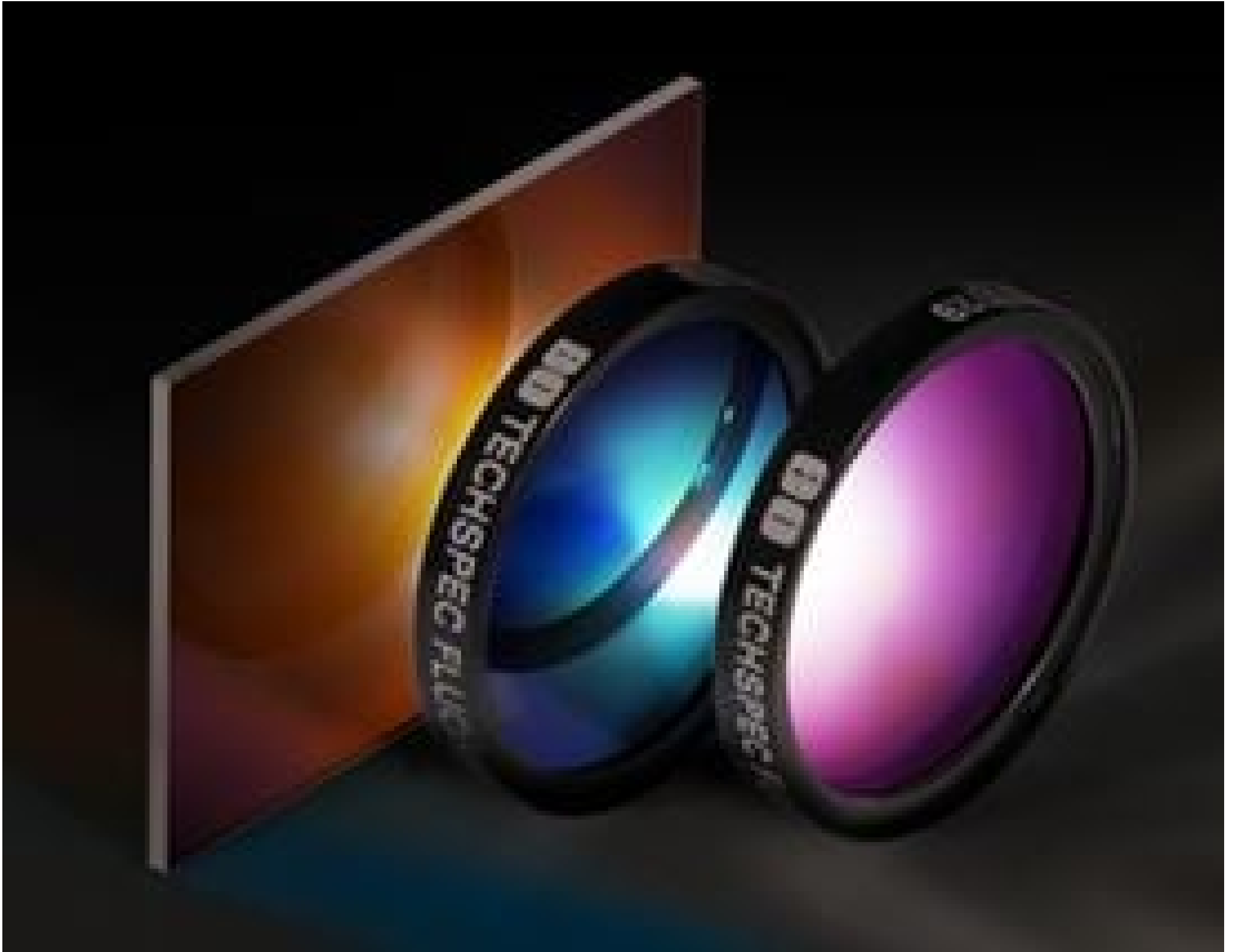
Fluorescence Filter Sets