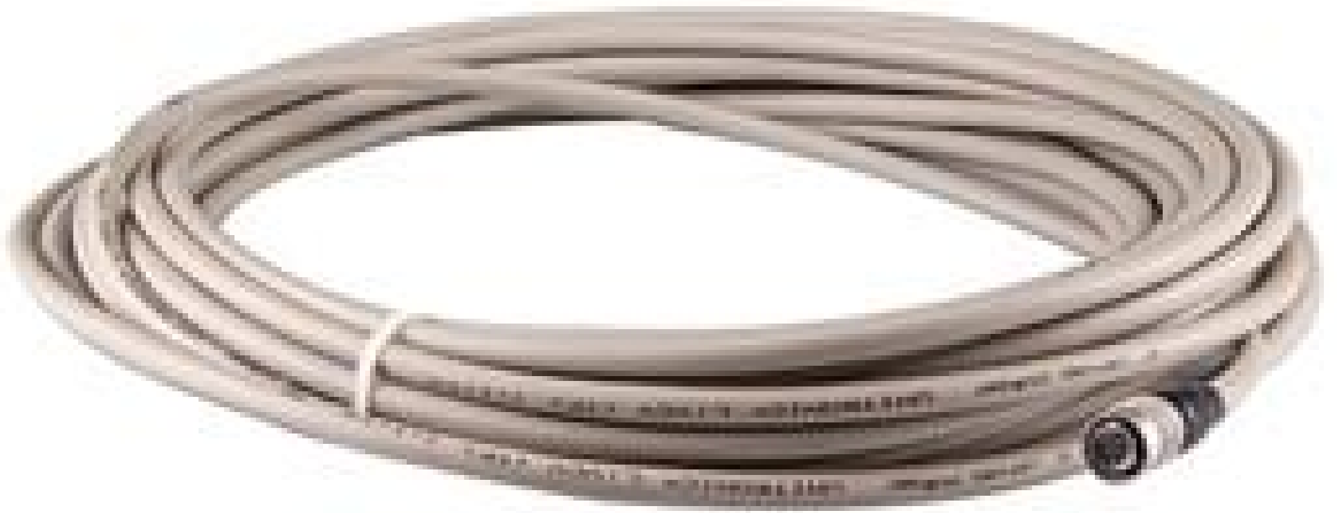
10m GPIO & Power Cable, #88-516