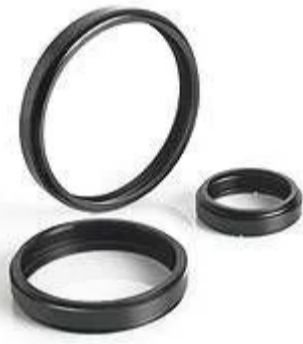
#67-692 - M58 x 0.75 Empty Filter Mount for 55mm Dia. Optics C$53.20