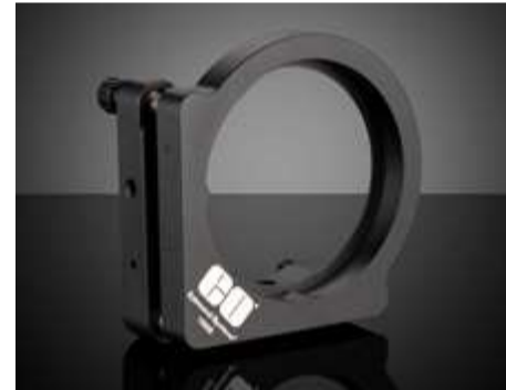
#15-868 - 75.0/76.2mm Optic Dia., E-Series Kinematic Mount C$334.60