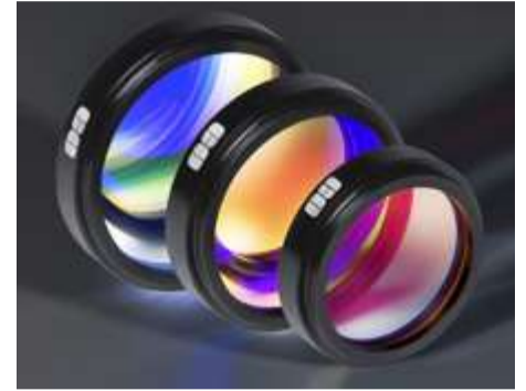
High Performance Mounted Machine Vision Filters