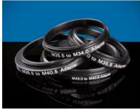
Machine Vision Filter Adapters