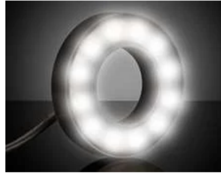
Machine Vision Lighting