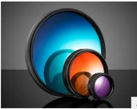
Mounted Machine Vision Filters