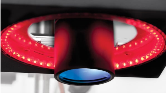
Hypercentric Lens in Borescope Mode