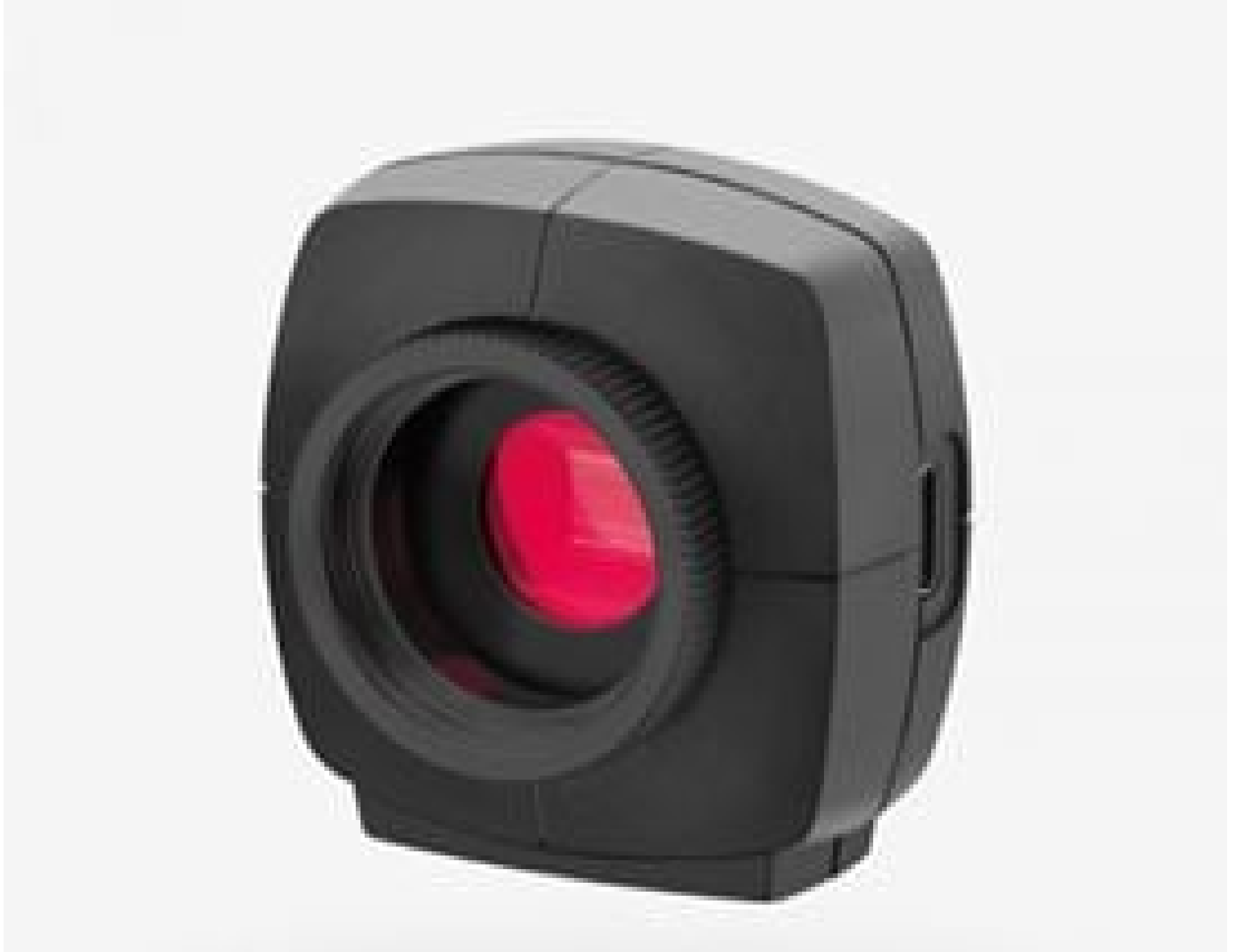
IDS Imaging uEye LE/XLE Camera (C/CS - Mount, Full Housing, Front View)

See More by IDS Imaging Development Systems