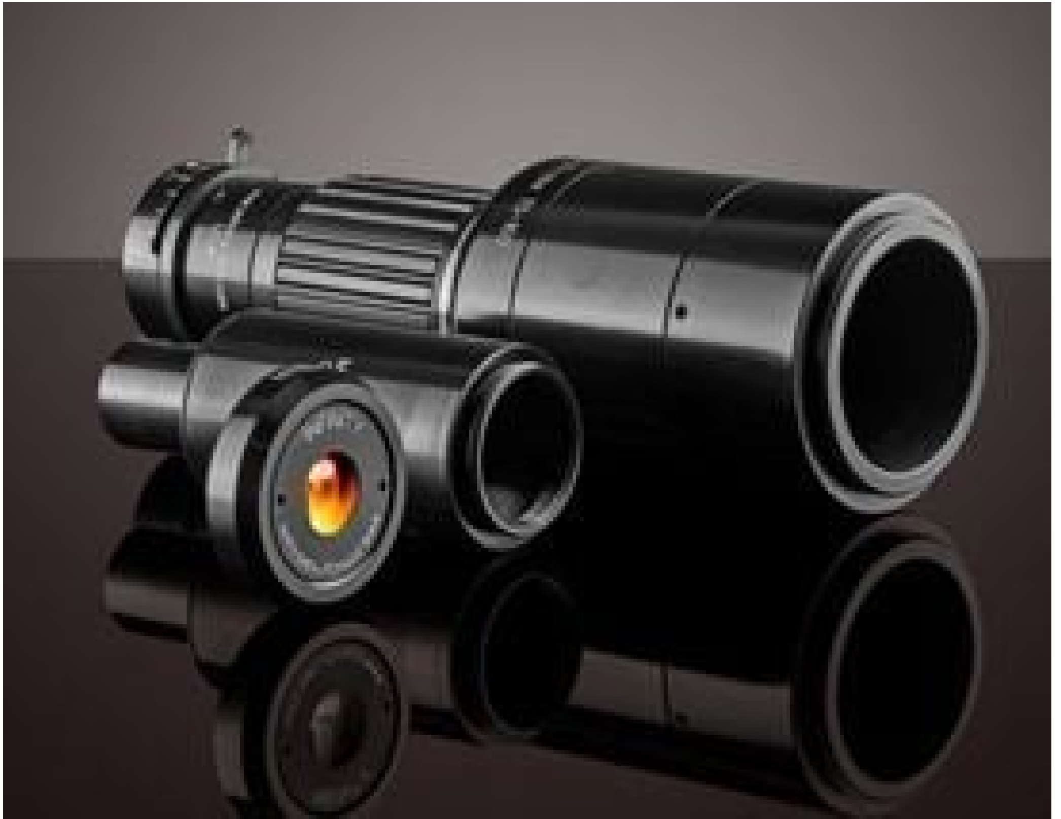
InfiniProbe TS-160, #34-715

See More by Infinity Photo-Optical Company