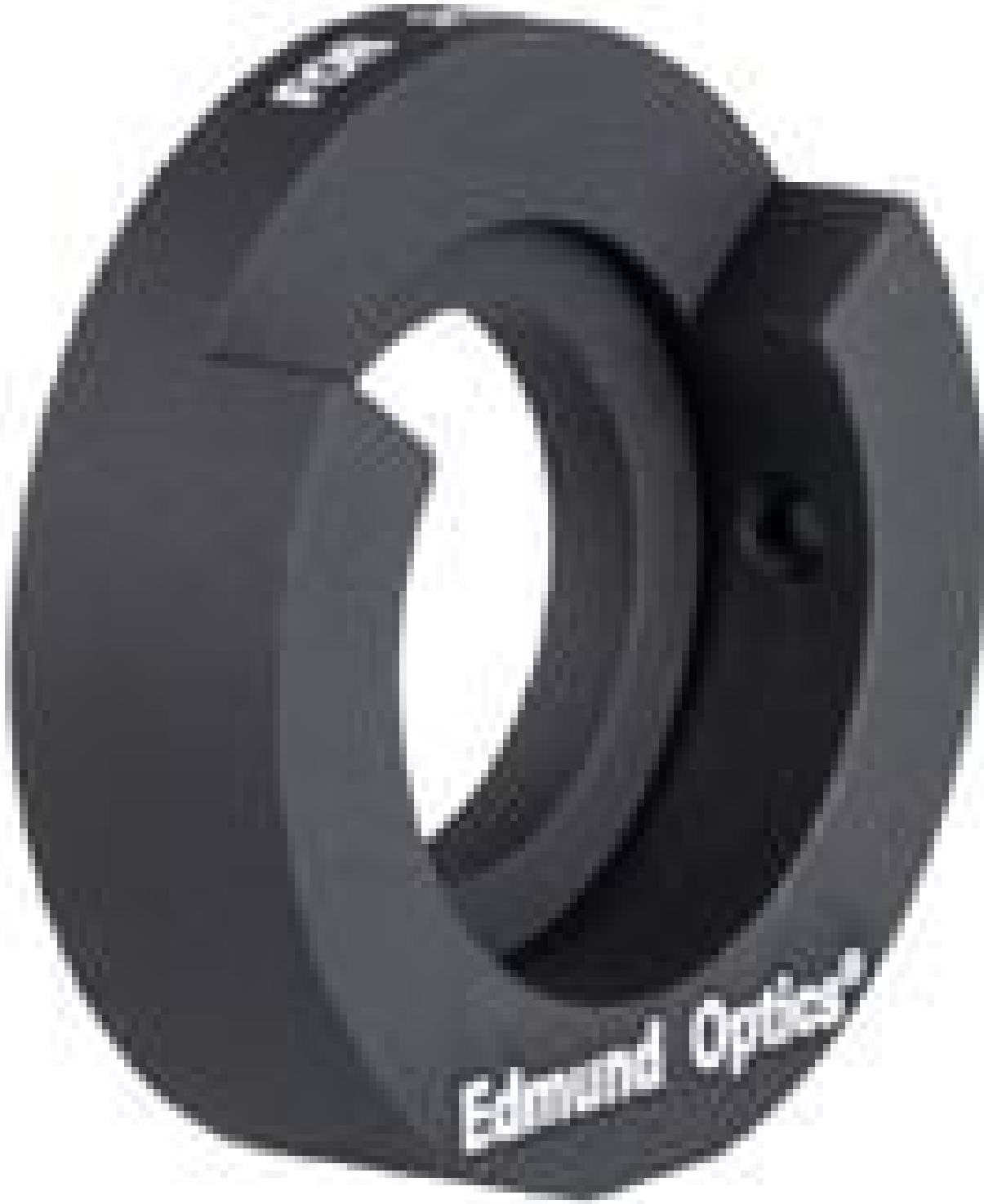
Iris Mount for 21mm Outer Diameter Irises, #54-862