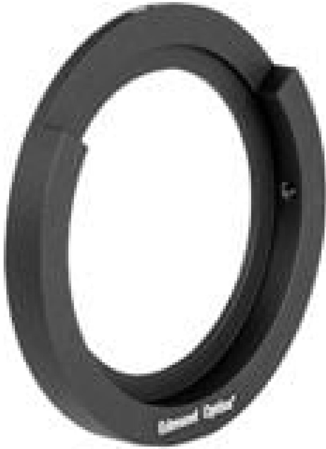
Iris Mount for 70mm Outer Diameter Irises, #53-921