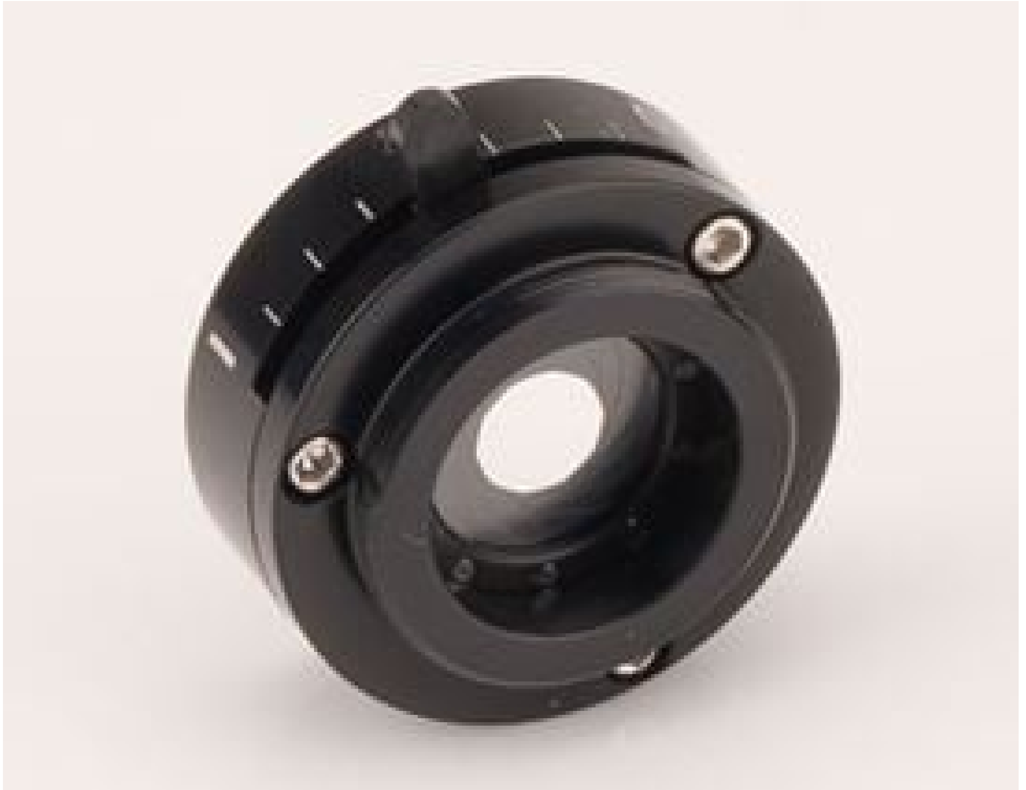
#53-789: KC Iris Diaphragm