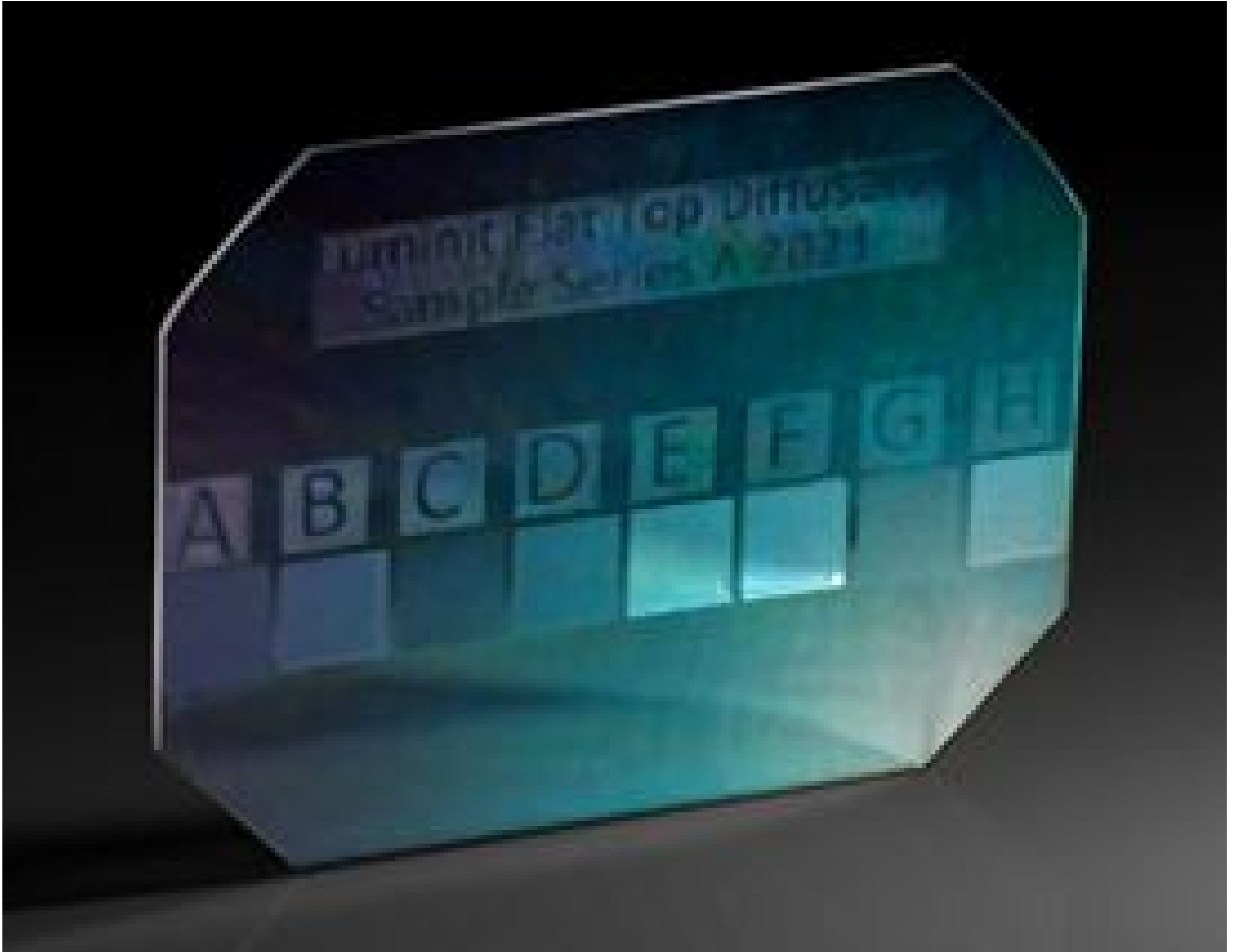
Flat Top Holographic Diffuser Sets