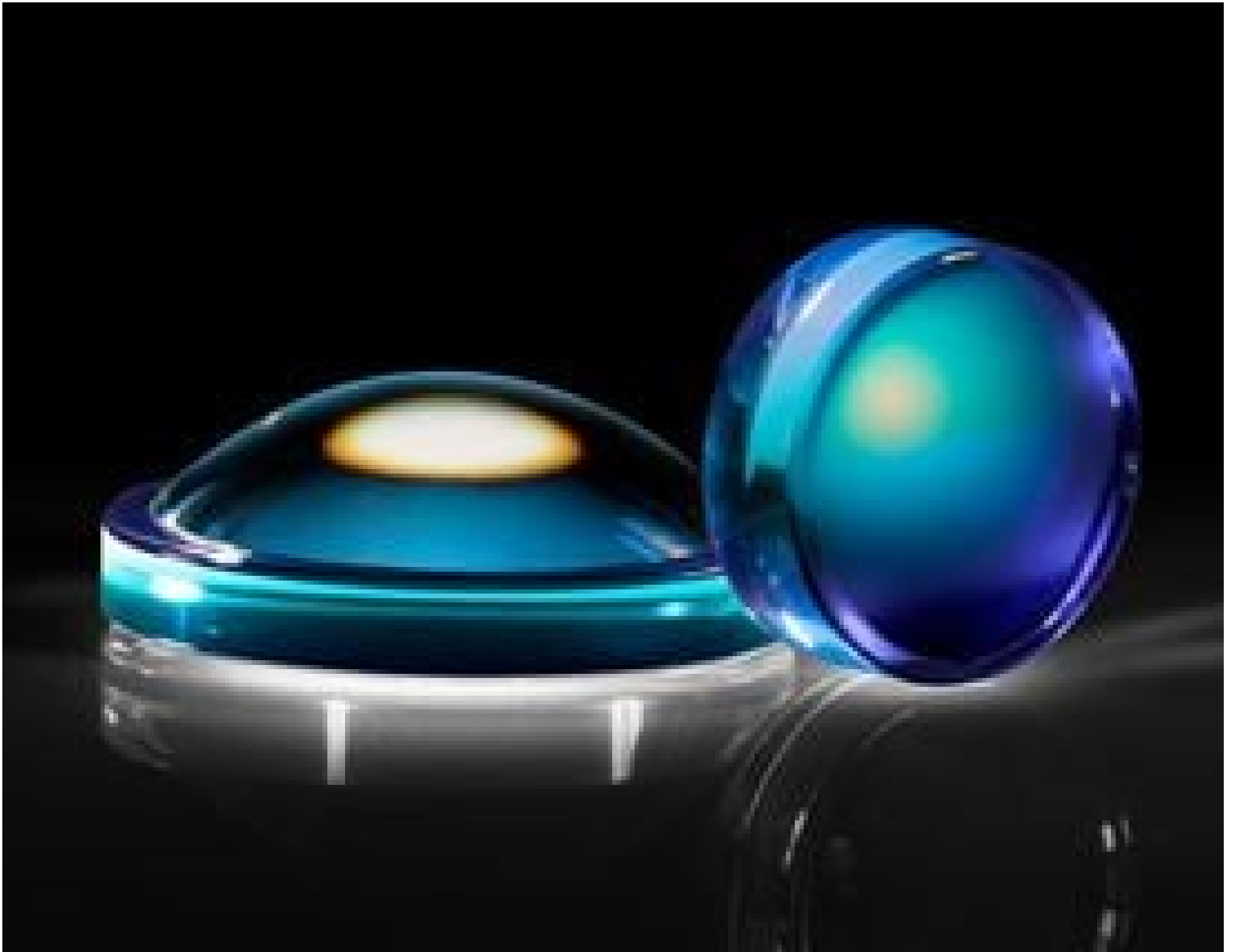
Precision Molded Aspheric Lenses