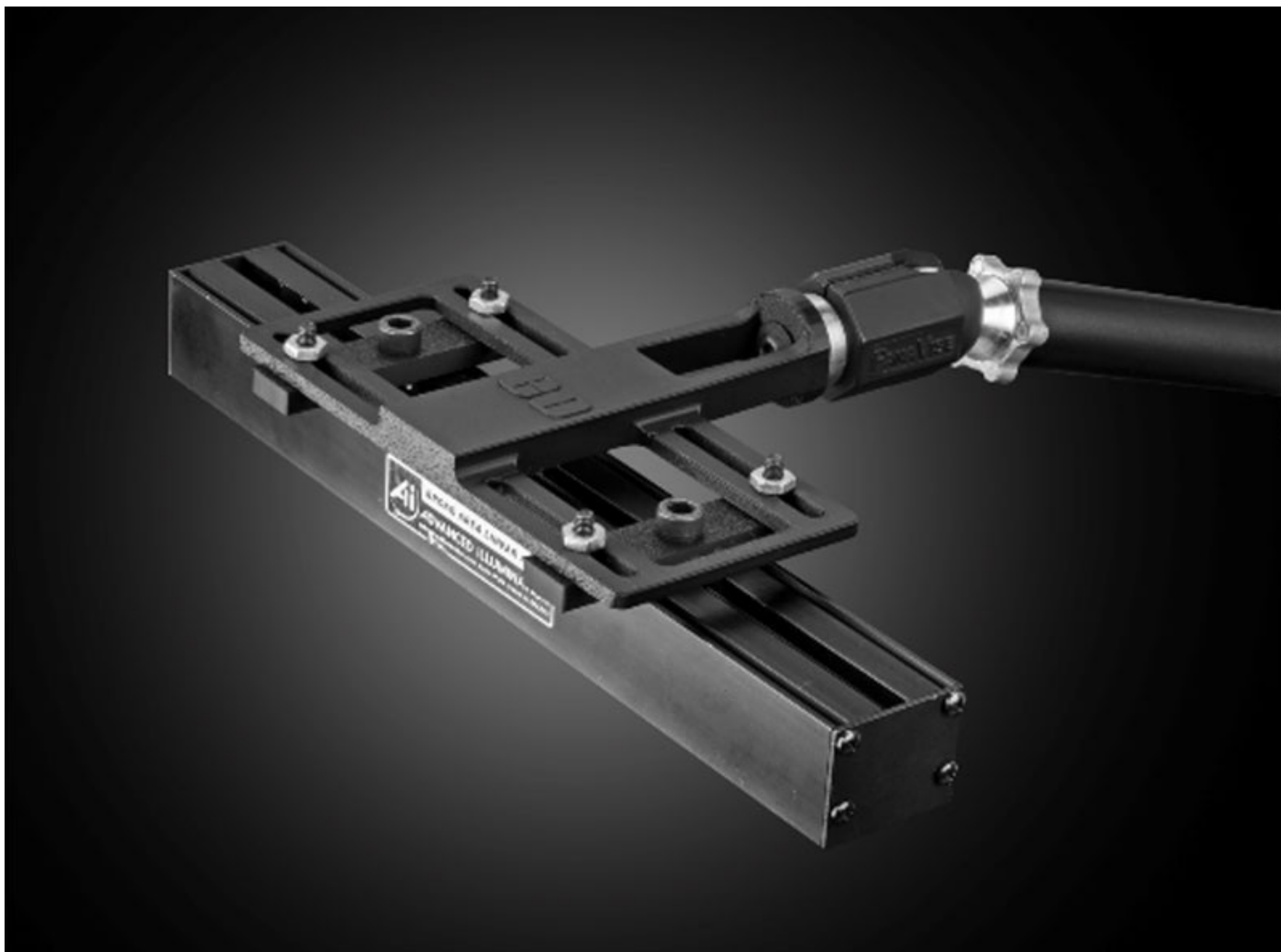
Bar or Line Light Configuration