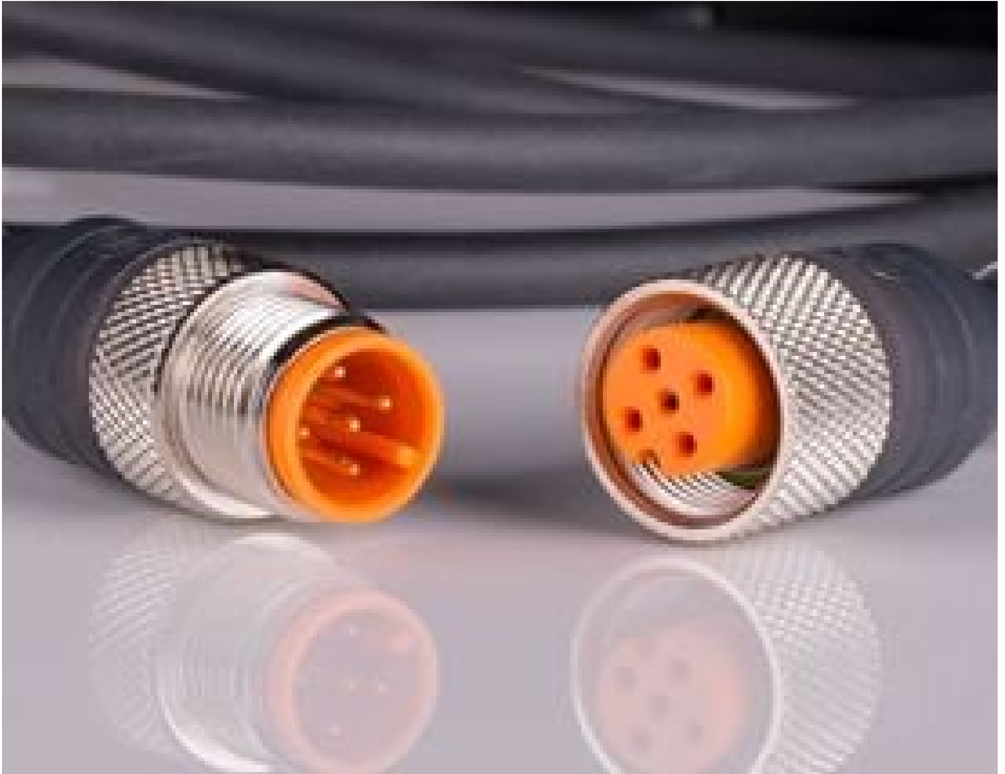
M12 Female to Male, 5 pin, 2m, #34-869