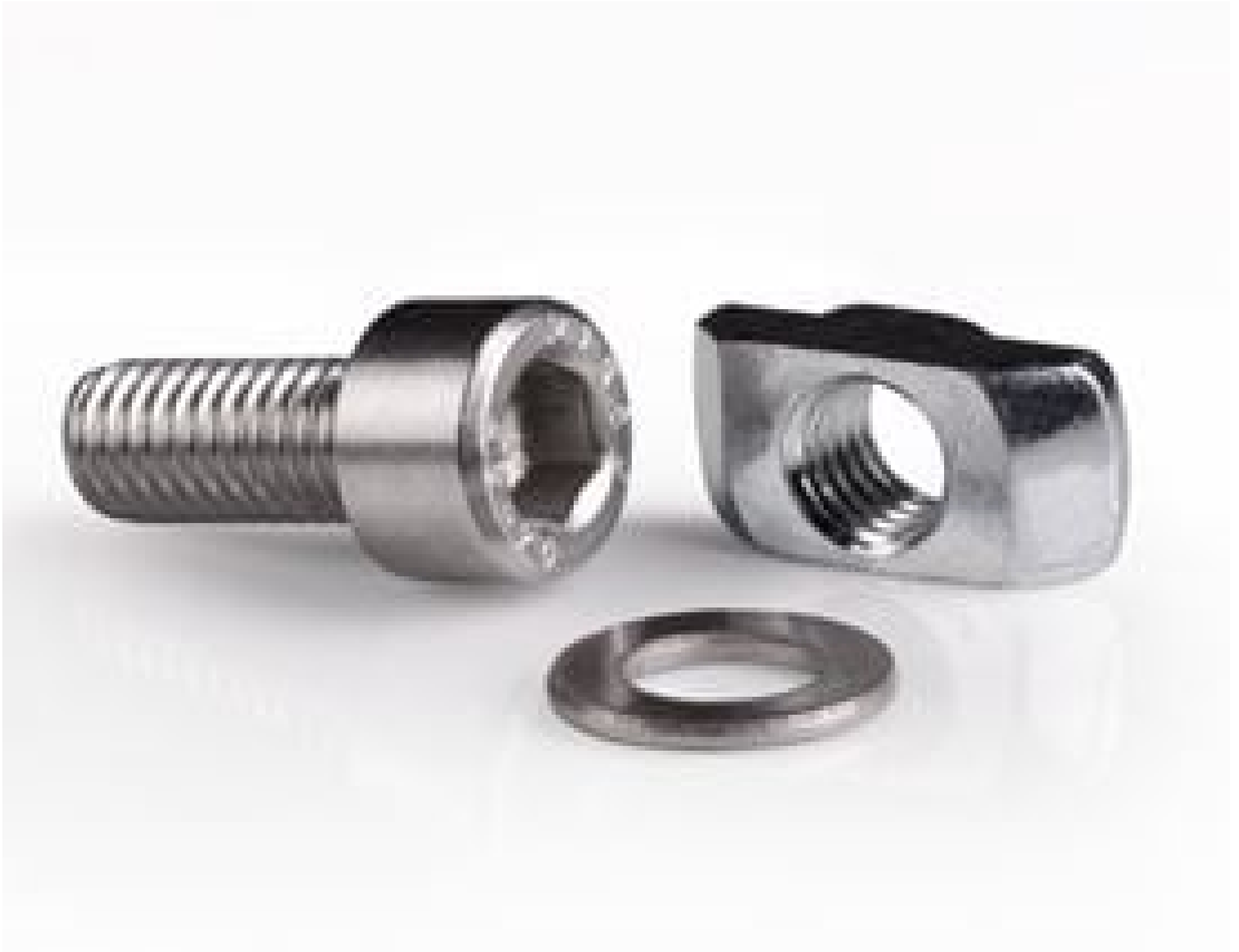
M6 T-Nut (includes M6 x 14 screw), #34-888