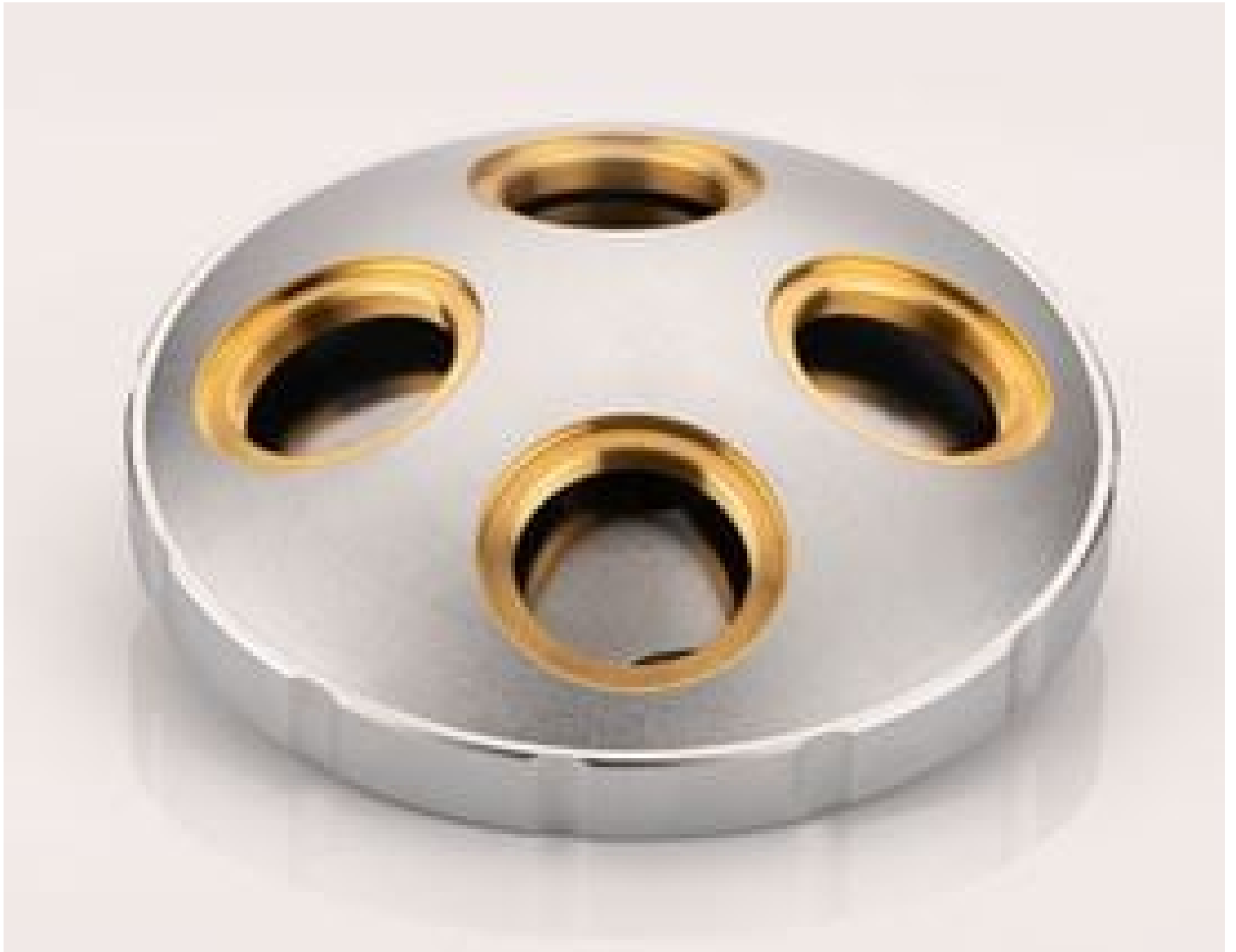
Manual Turret for Mitutoyo Widefield Video Microscope Unit