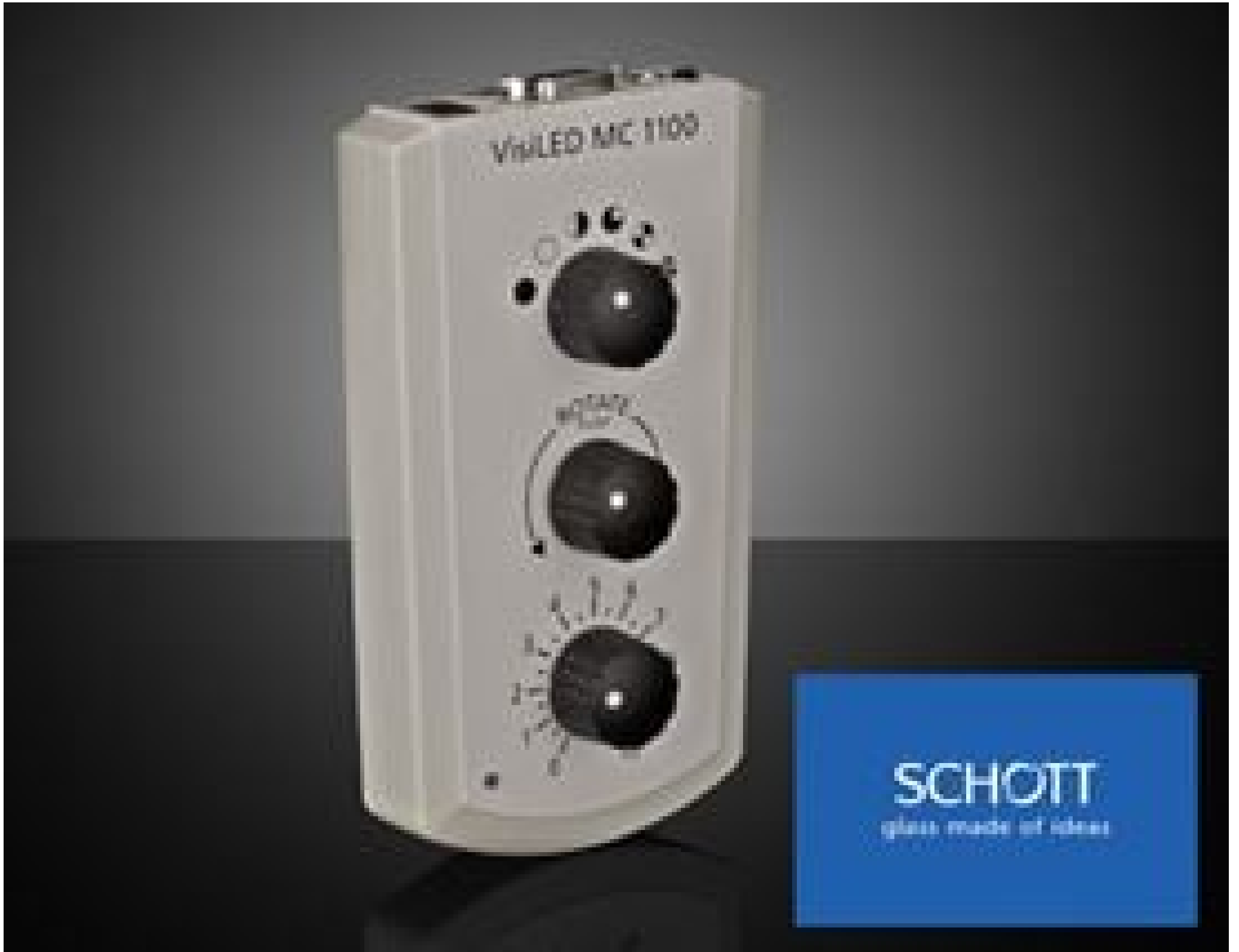
MC 1100, Multifunction Controller, #16-790