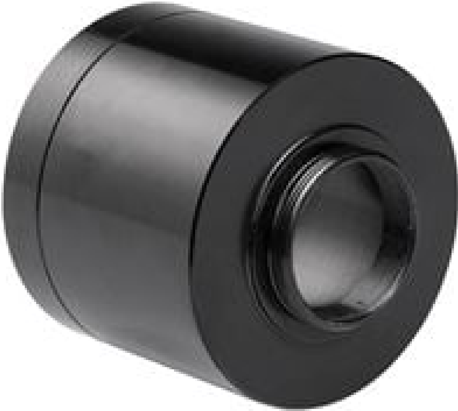
Mitutoyo MT-1/MT-2 C-mount Adapter, #58-329