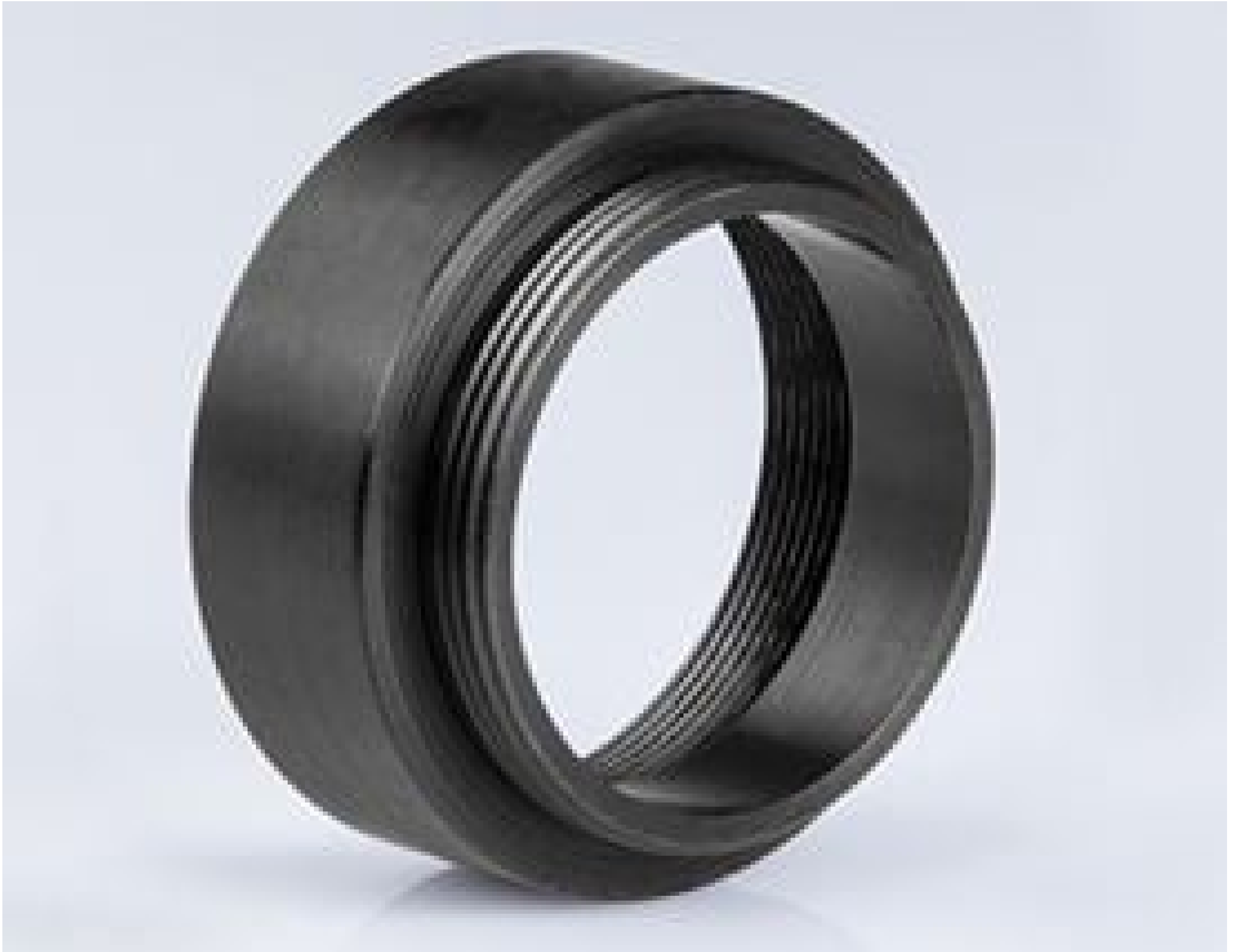
Mitutoyo to C-mount 10mm Adapter, #55-743