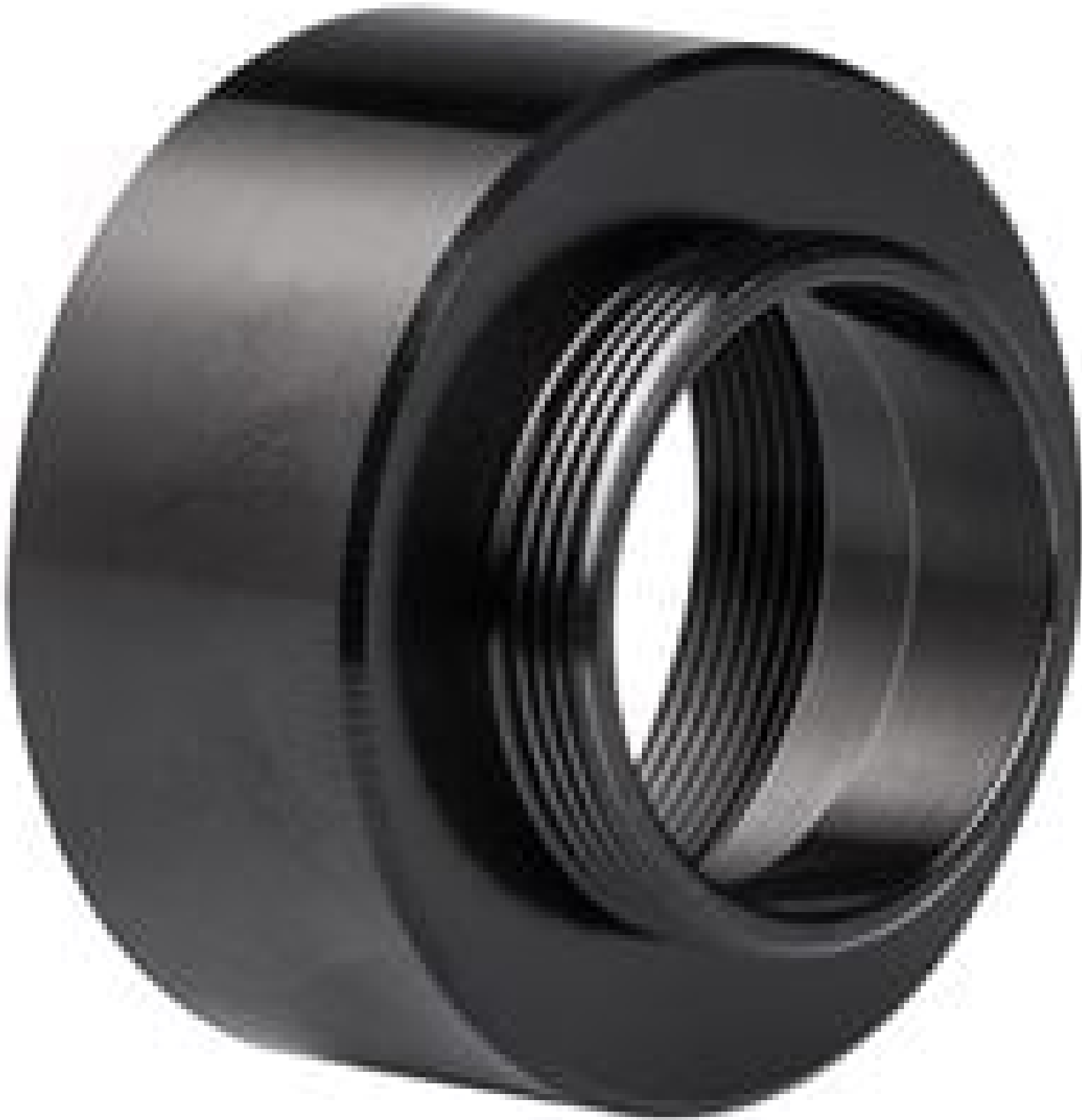
Mitutoyo to RMS Adapter, #58-296