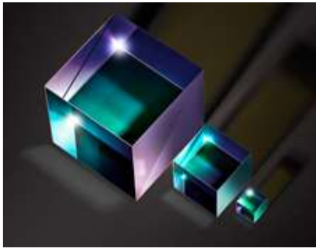
#32-503 - 15mm 50R/50T Cube Beamsplitter C$331.80