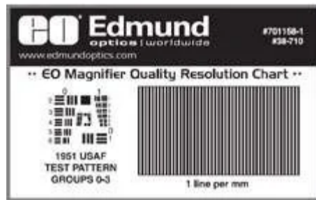
#38-710 - USAF Resolution Target Pocket Size C$13.65