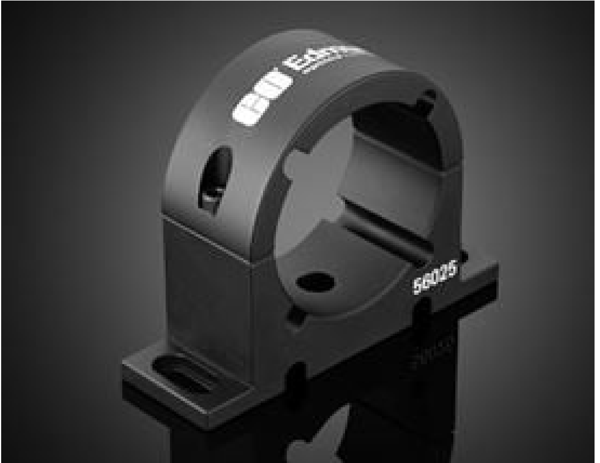
#56-025: Mounting Clamp, 65mm Inner Diameter