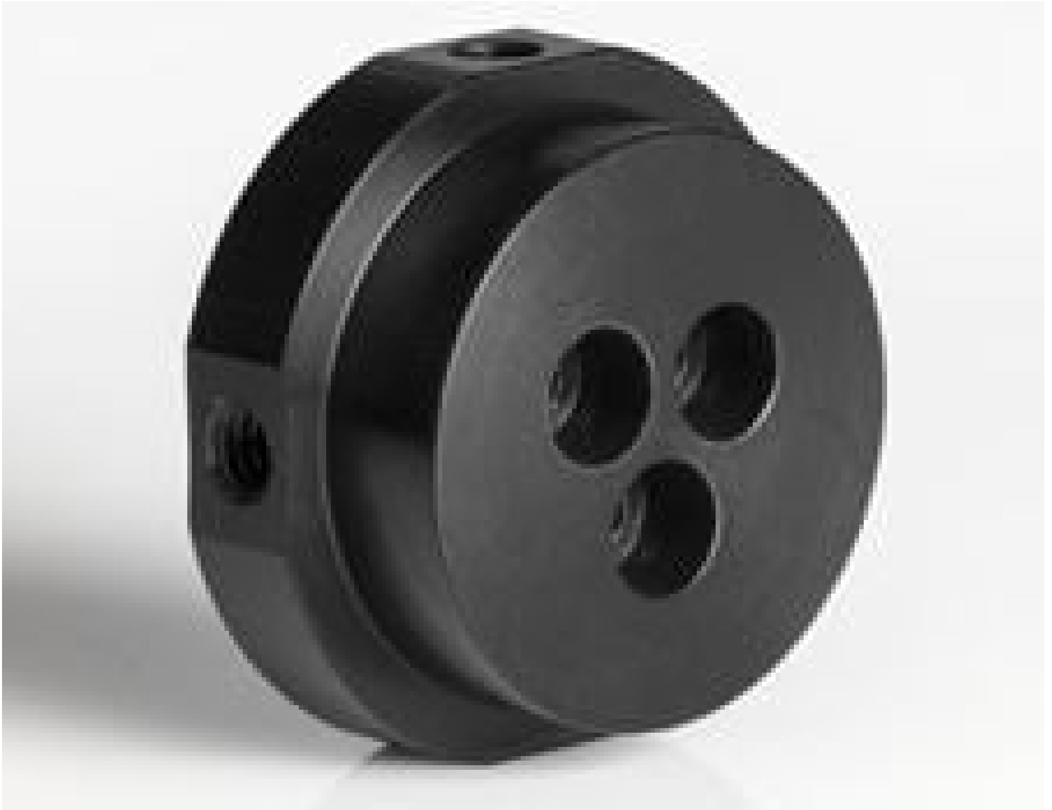
Mounting Plate for 12.7mm Diameter Off-Axis Mirrors, #34-425