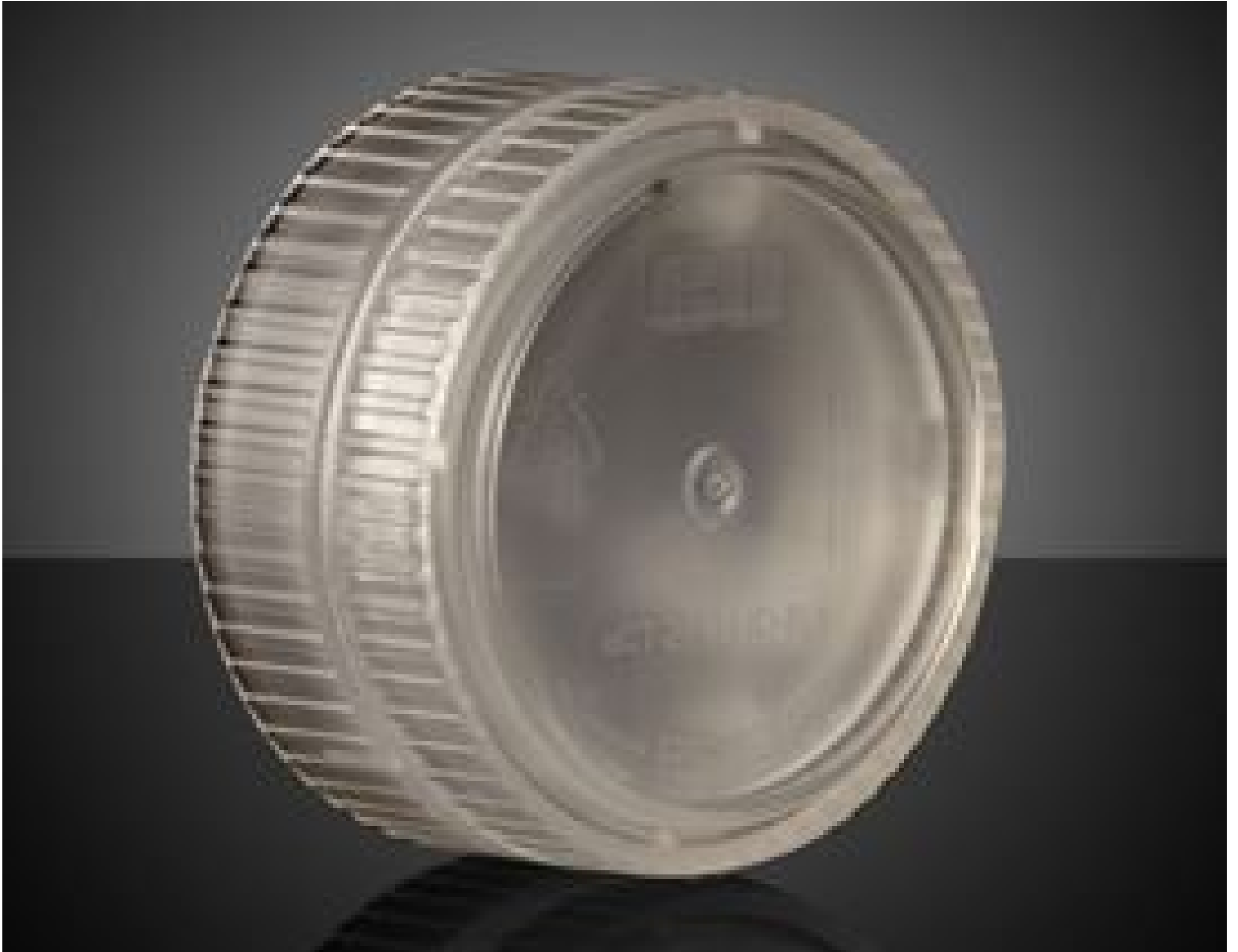
Non-Contact Impact Case for 25.4 Dia. Optics