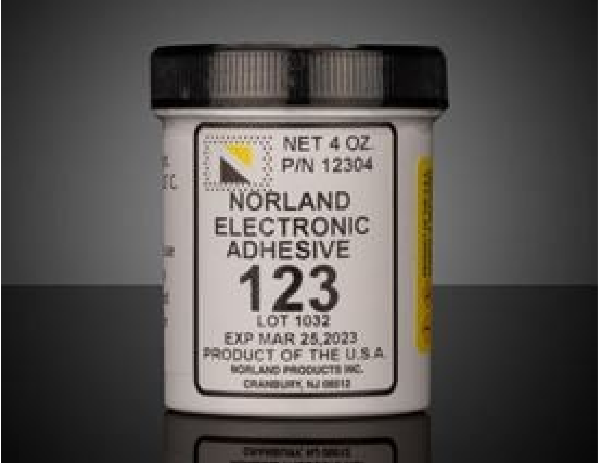
Norland Electronic Adhesive NEA 123, 4 oz Bottle