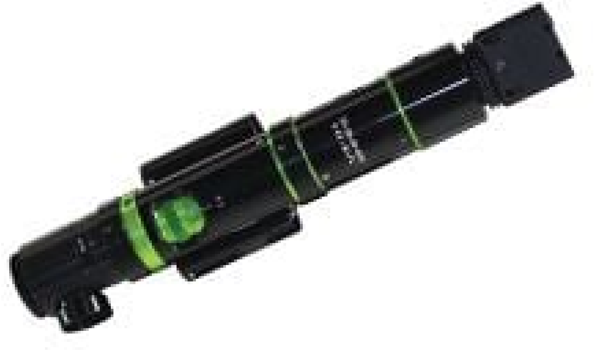
Photo represents a complete Zoom Lens. For individual component line art, see the Technical Information tab.