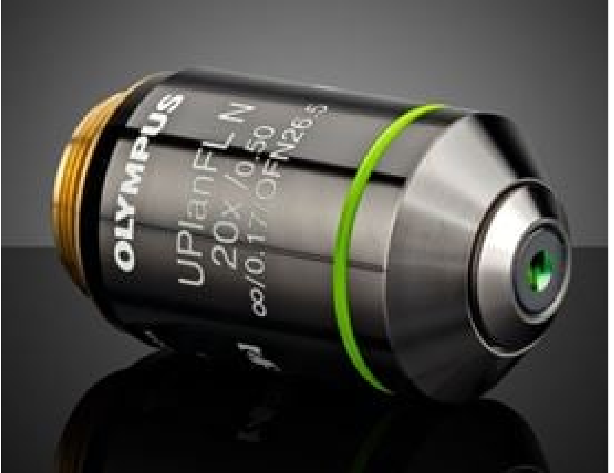
Olympus UPLFLN 20X Objective