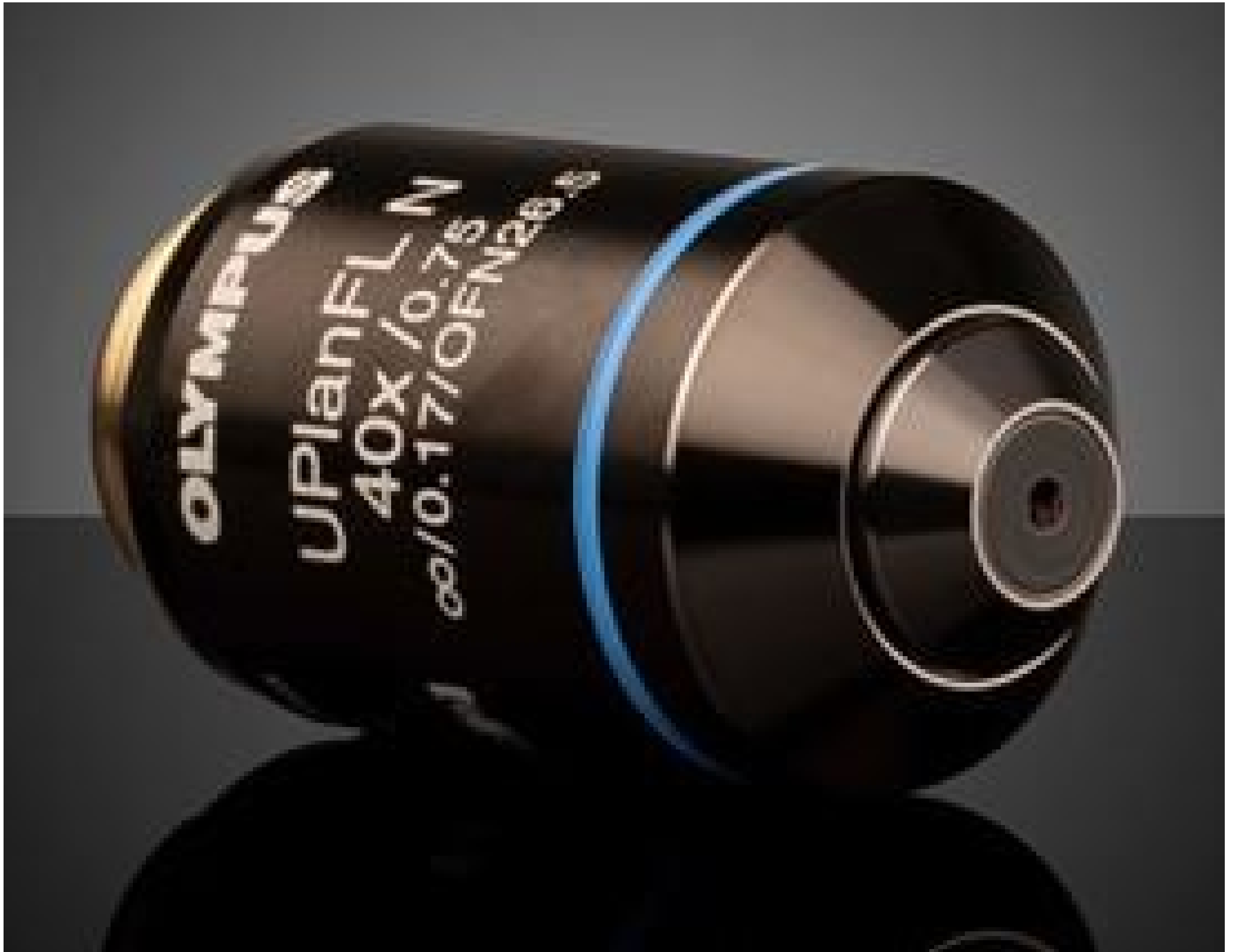
Olympus UPLFLN 40X Objective