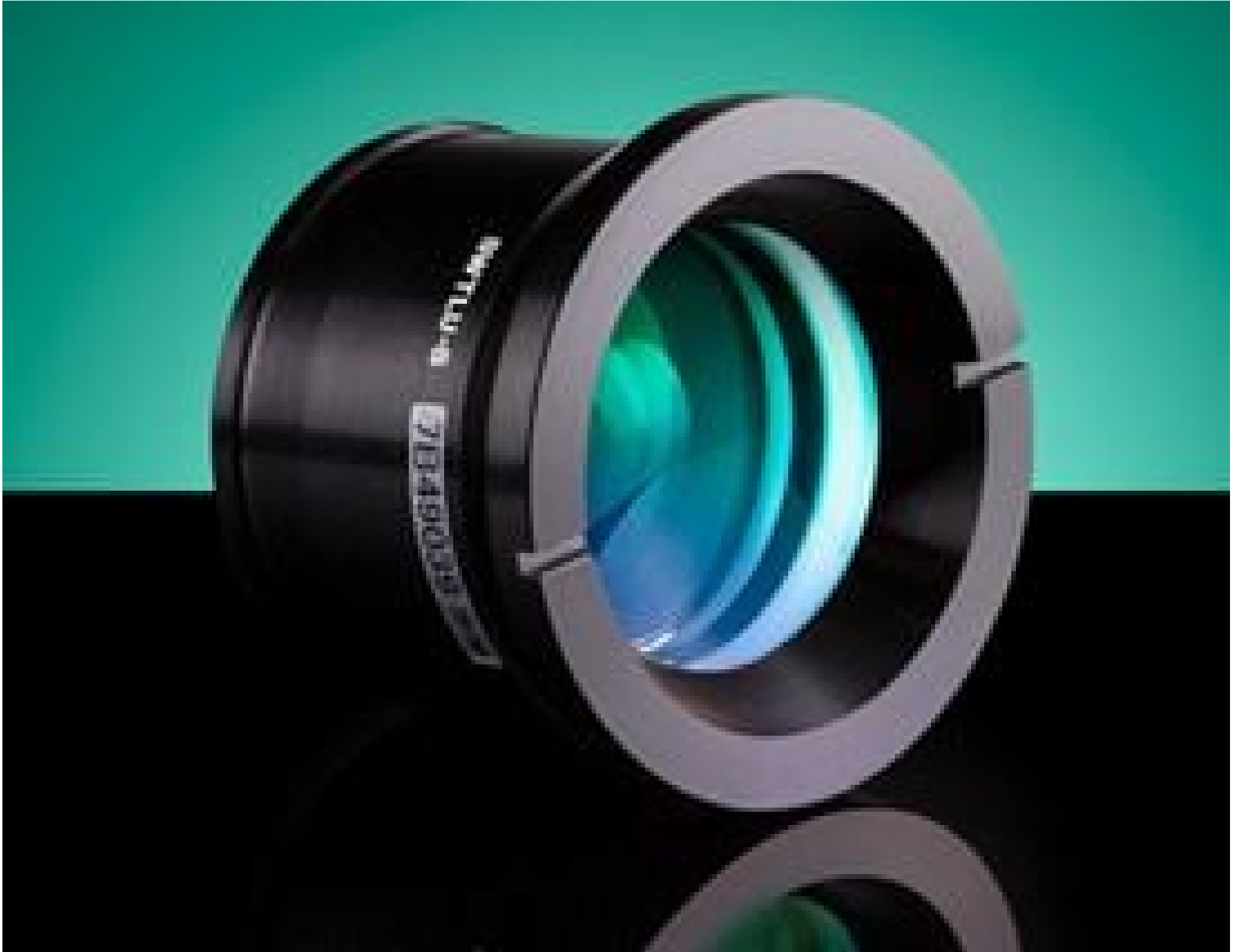
Olympus Wide Field Tube Lens, #36-401