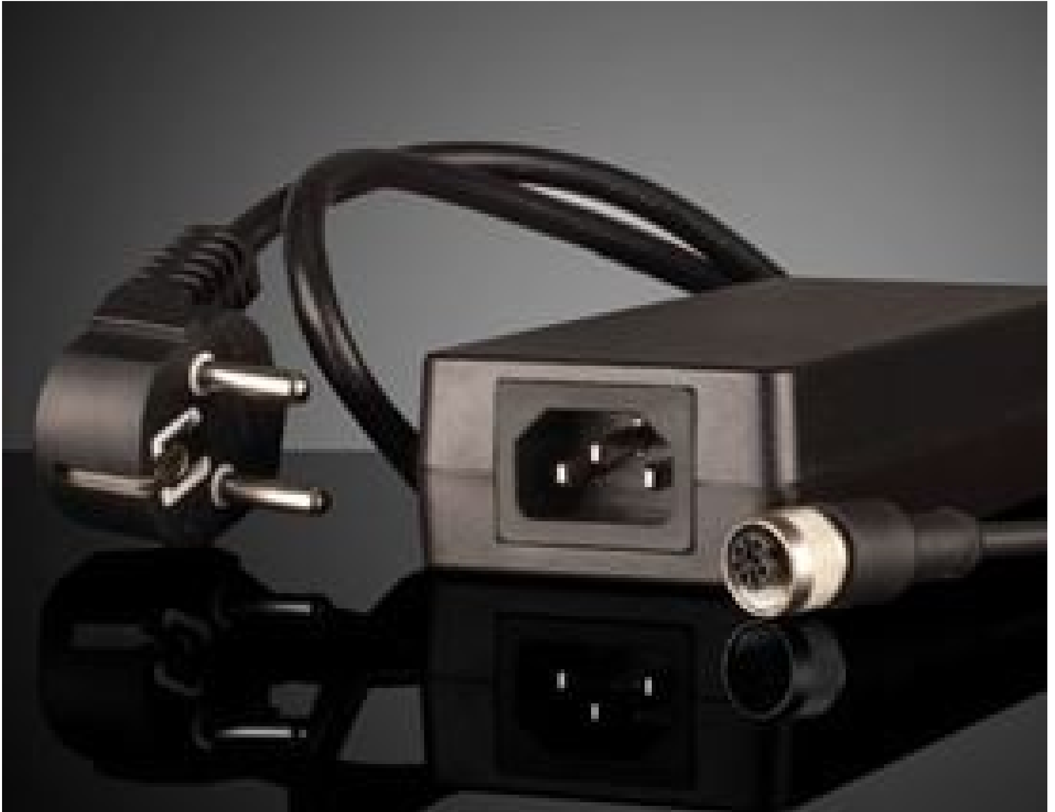
Power Supply for Effilux LED Lights, EU Adapter