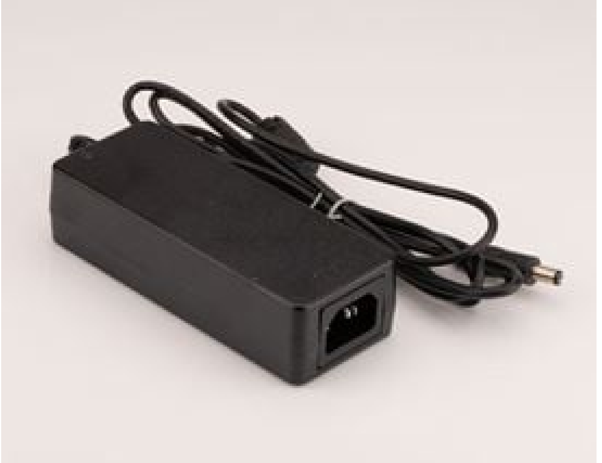
#16-791: Power Supply for SCHOTT VisiLED Ringlights