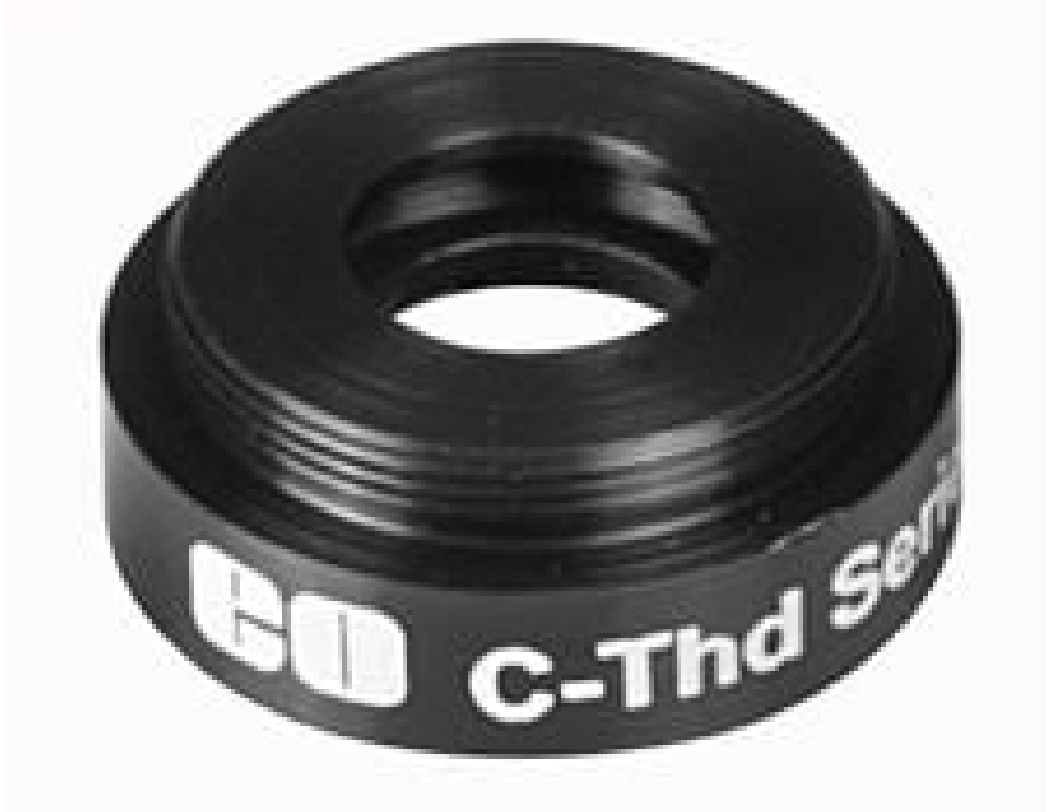
C-Mount to TO-8 Detector Mount, #58-733